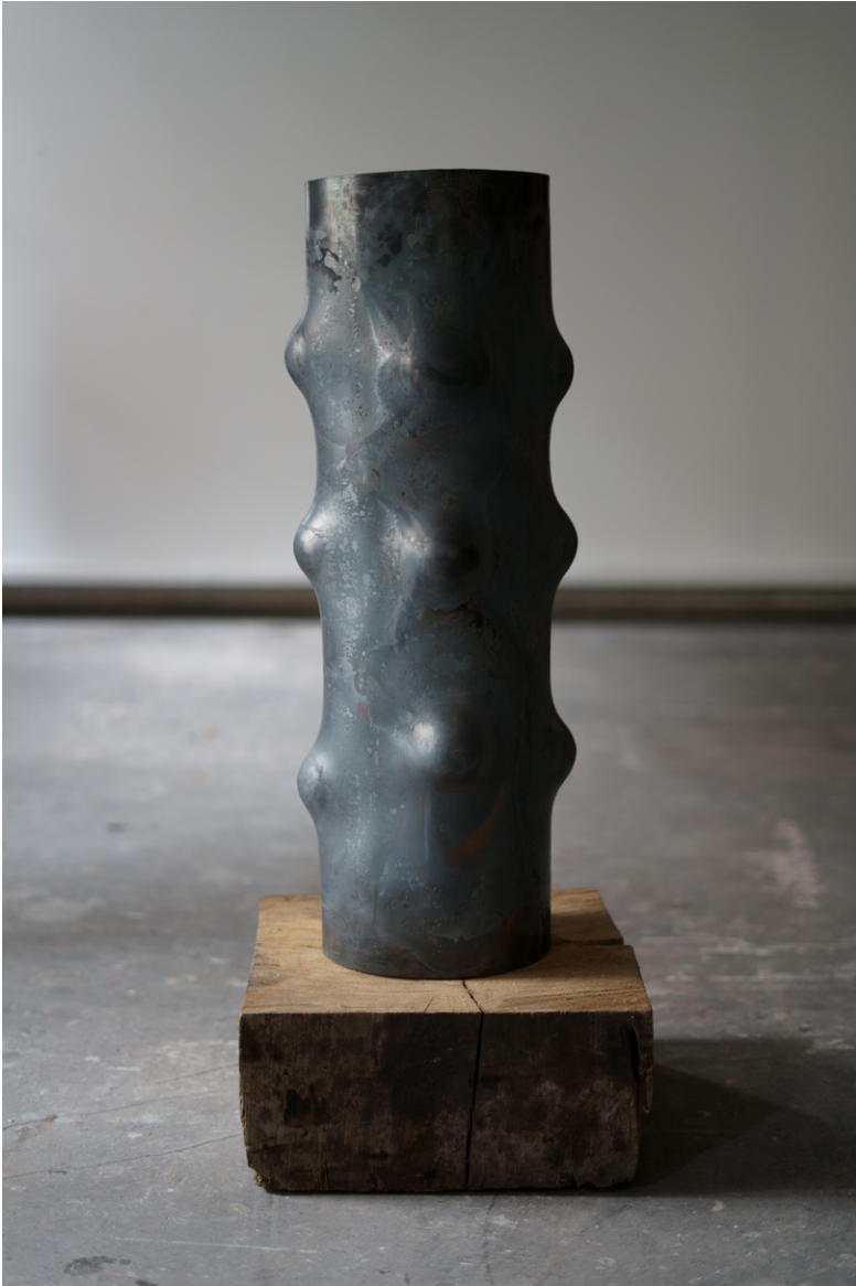
Bois , 2018

Sculpture; Steel tube 76 x 27 x 27 cm Plinth: 17 x 40 x 39 cm