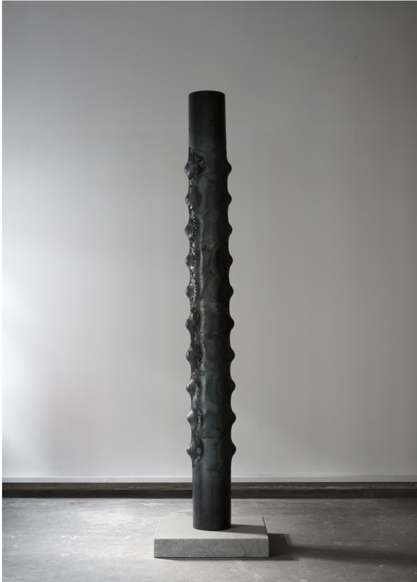
Baum , 2018

Sculpture; Steel tube 250 x 27 x 27 cm Plinth: 10,5 x 62 x 62 cm