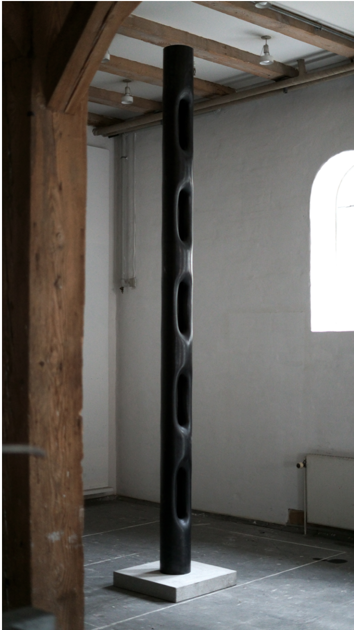
Totem , 2018

Sculpture; Steel tube 352 x 12 cm Plinth: 7,5 x 62 x 62 cm