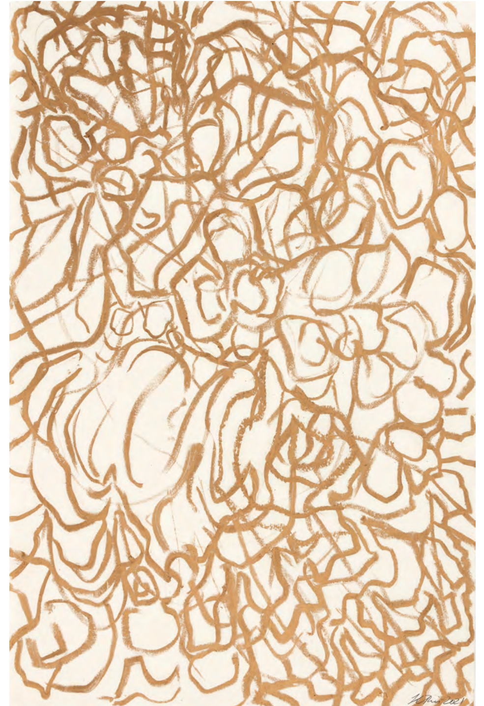
HANNE FRIIS Paris II 2021 Sennelier oil pastel on paper 101 x 69 cm (framed) Unique piece