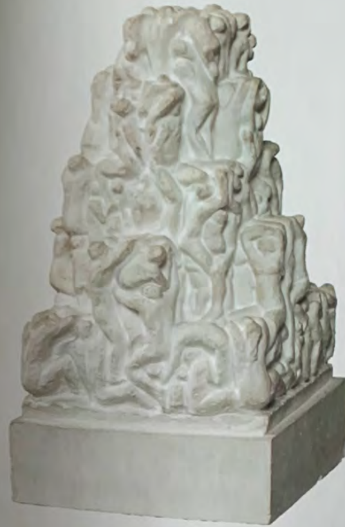
Cat. 195 Gustav Vigeland Human Mountain , 1919