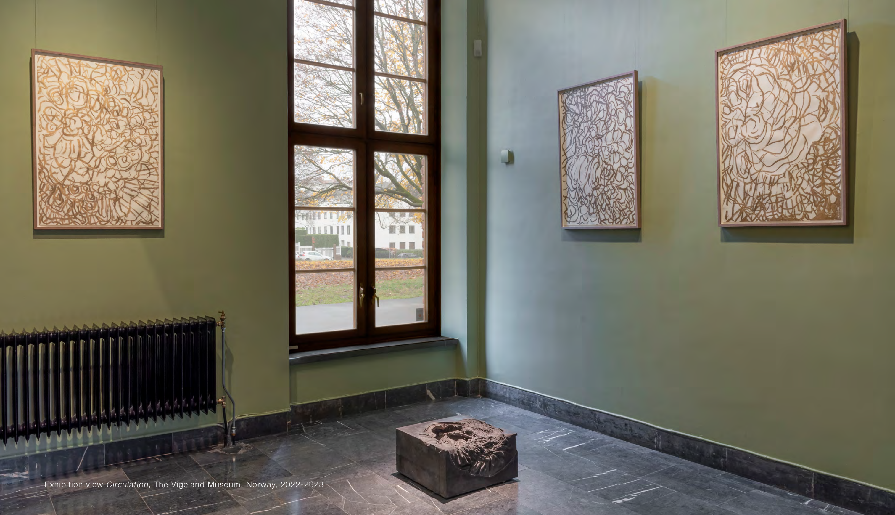
Exhibition view Circulation , The Vigeland Museum, Norway, 2022-2023