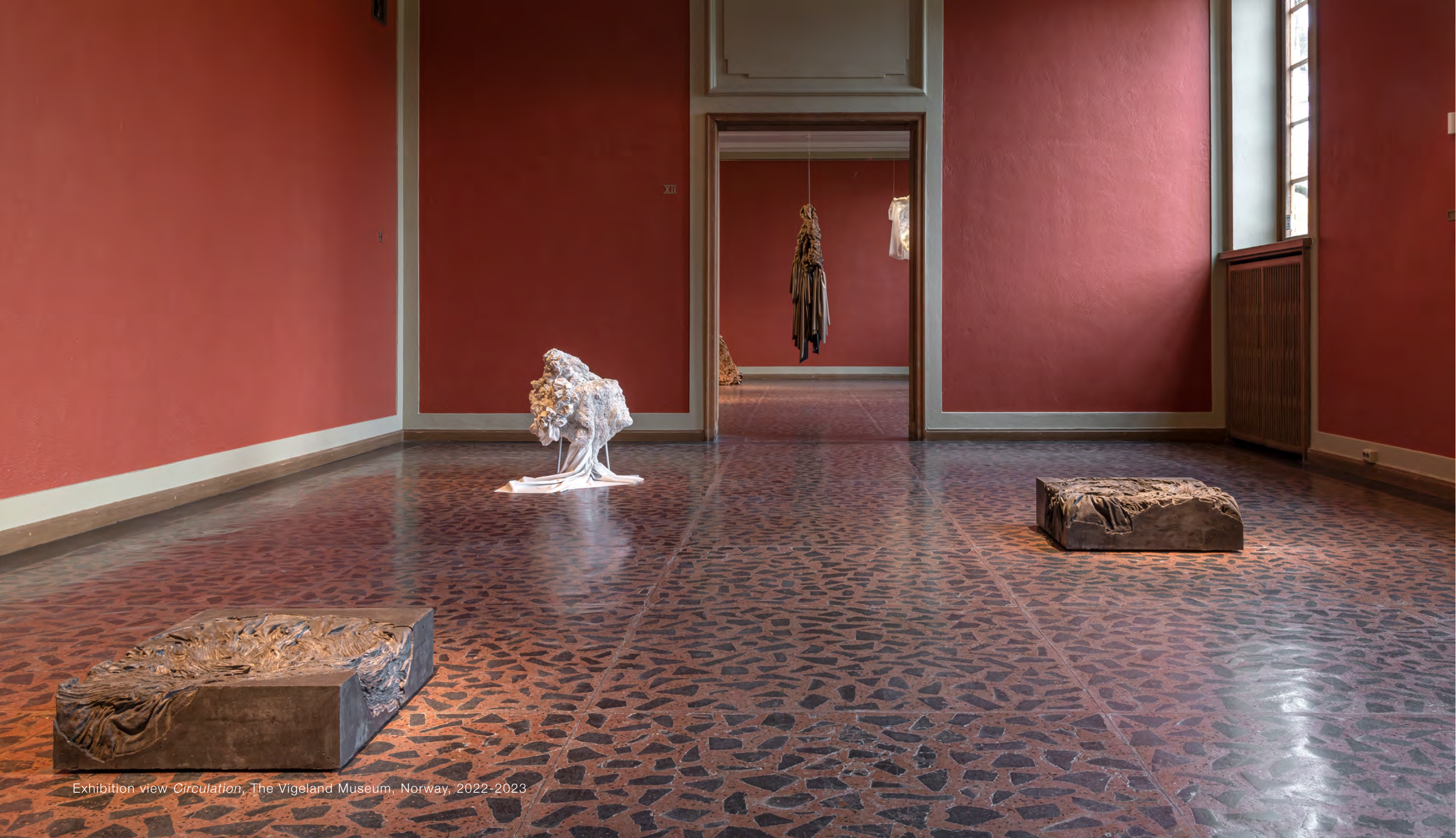
Exhibition view Circulation , The Vigeland Museum, Norway, 2022-2023