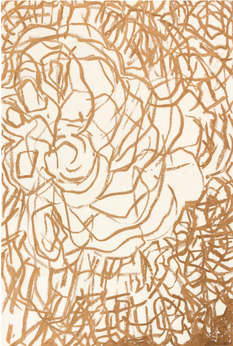
HANNE FRIIS Paris III 2021 Sennelier oil pastel on paper 101 x 69 cm (framed) Unique piece