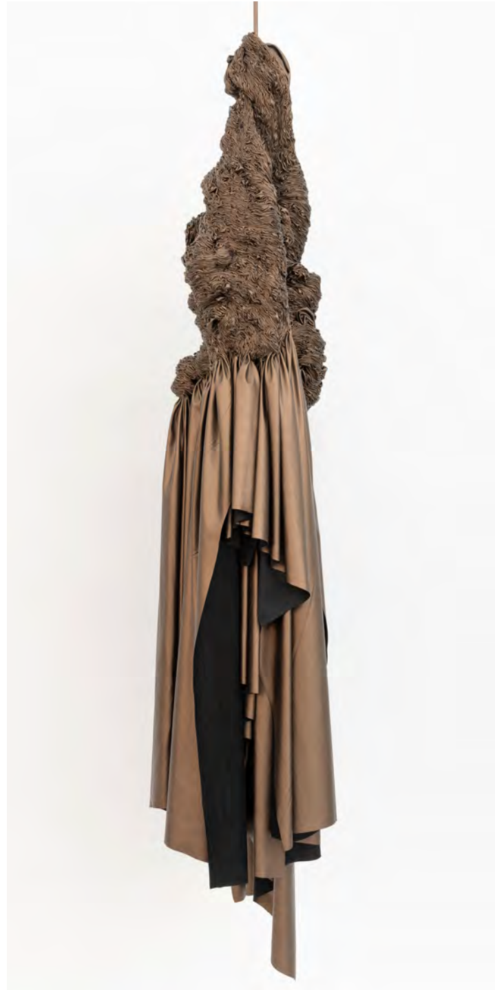
HANNE FRIIS Dance 2022 Imitation leather, steel; hand-stitched 198 x 50 x 30 cm Unique piece