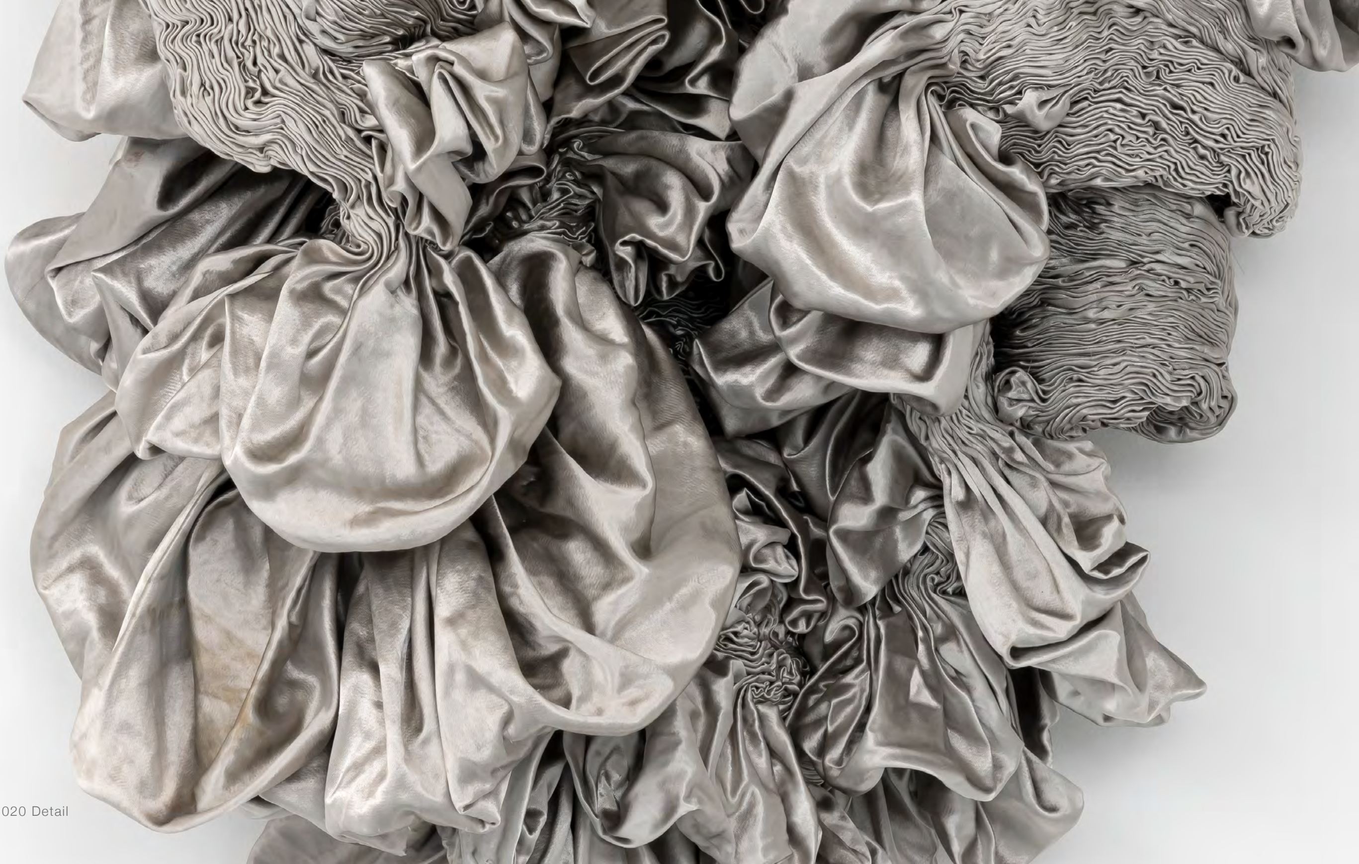
Gorge II , 2020 Detail