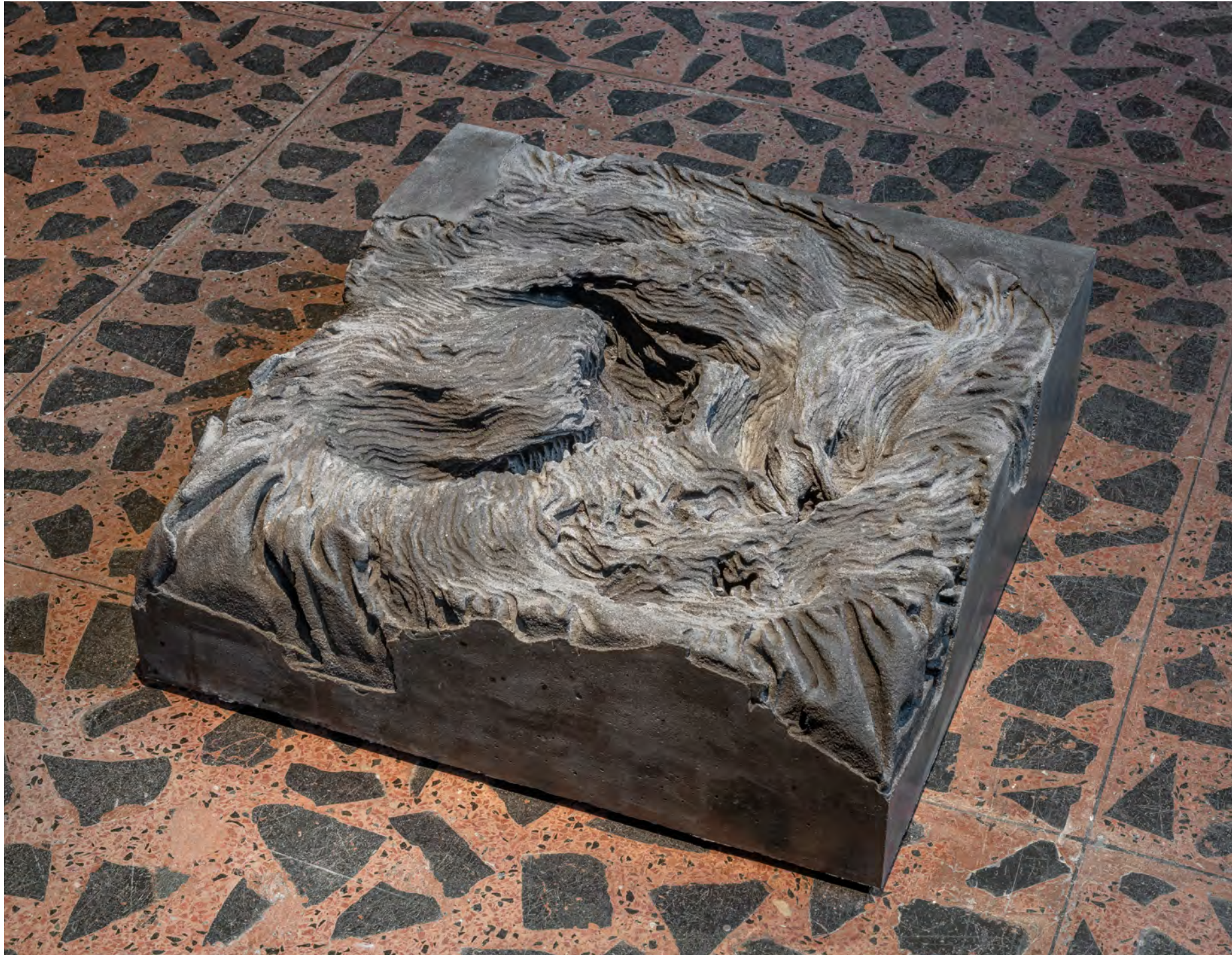
HANNE FRIIS Imprint III 2022 Concrete 20,5 x 67 x 67 cm Unique piece