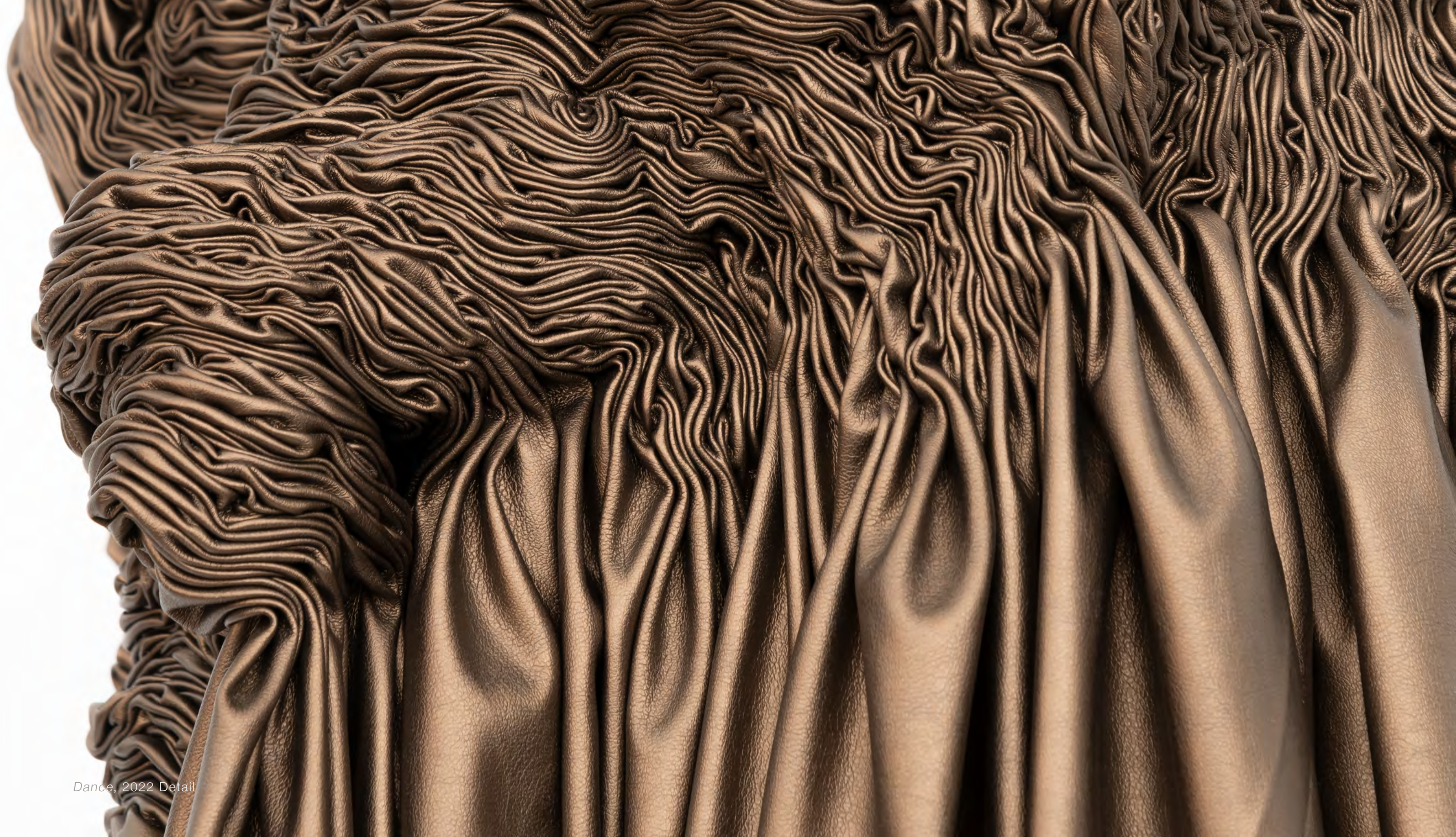
Dance, 2022 Detail