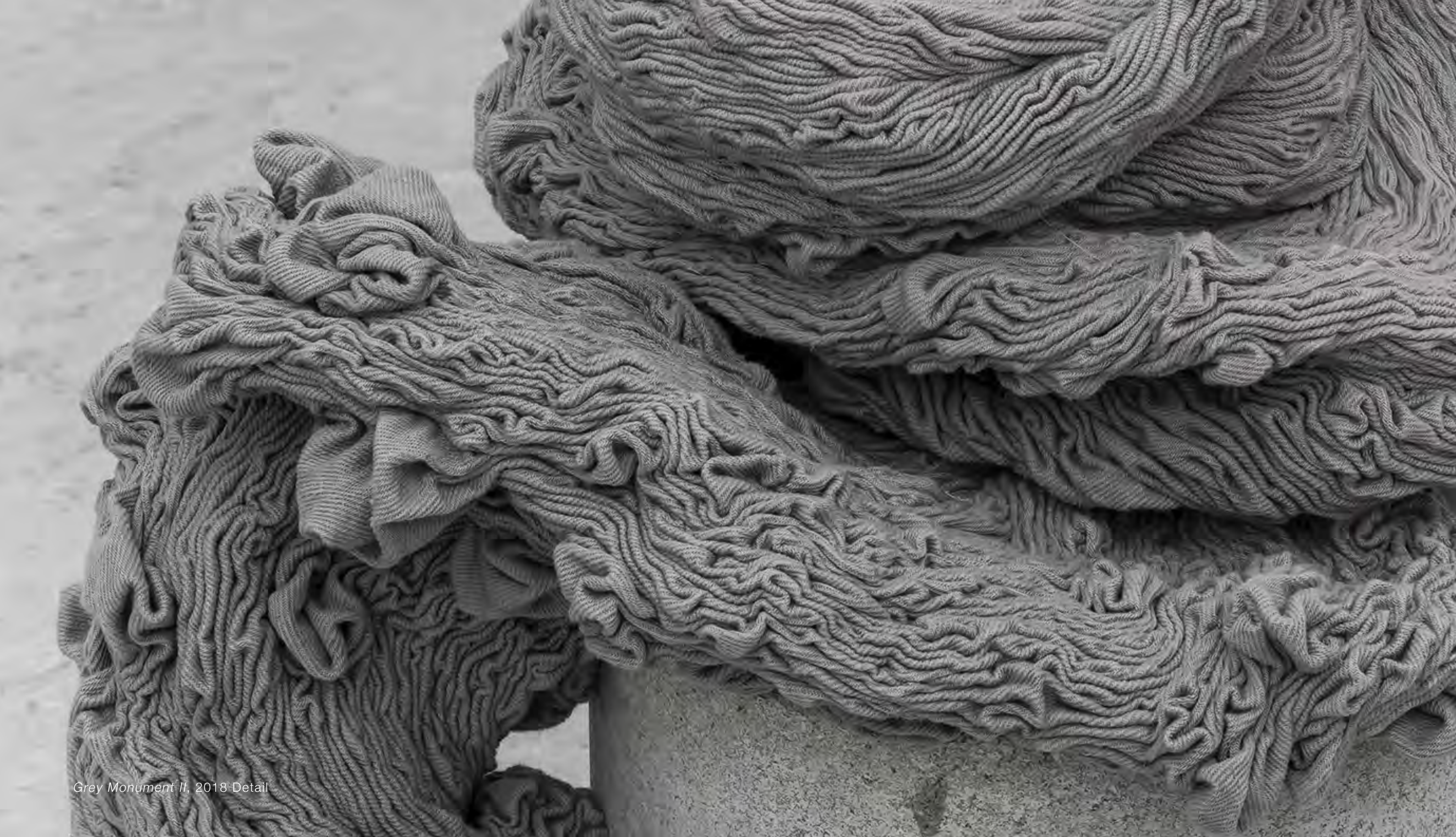
Grey Monument II, 2018 Detail