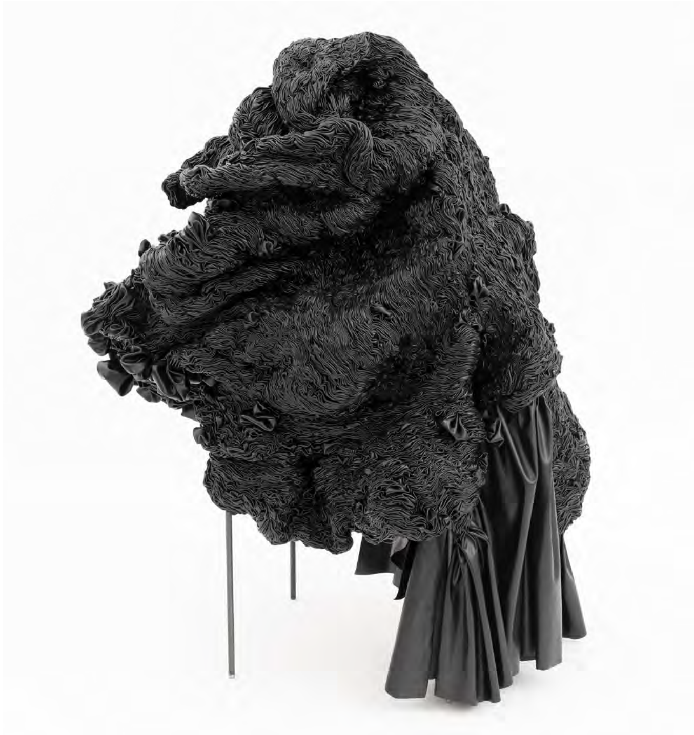
HANNE FRIIS La Vague 2020-22 Imitation leather, steel; hand-stitched 98 x 78 x 75 cm Unique piece