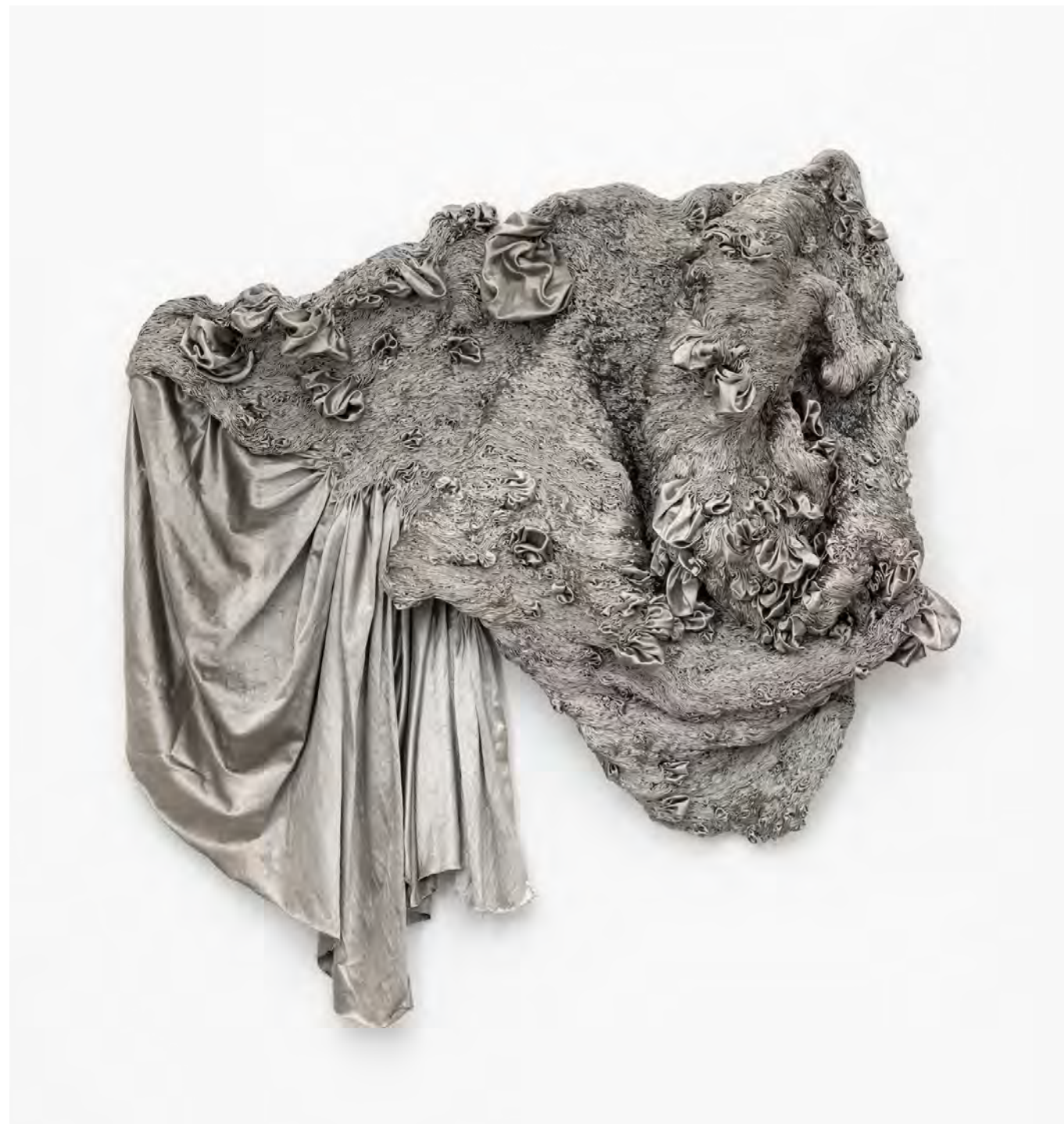
HANNE FRIIS Shiny Wave 2020 Natural dyed viscose; hand-stitched 135 x 120 x 25 cm Unique piece