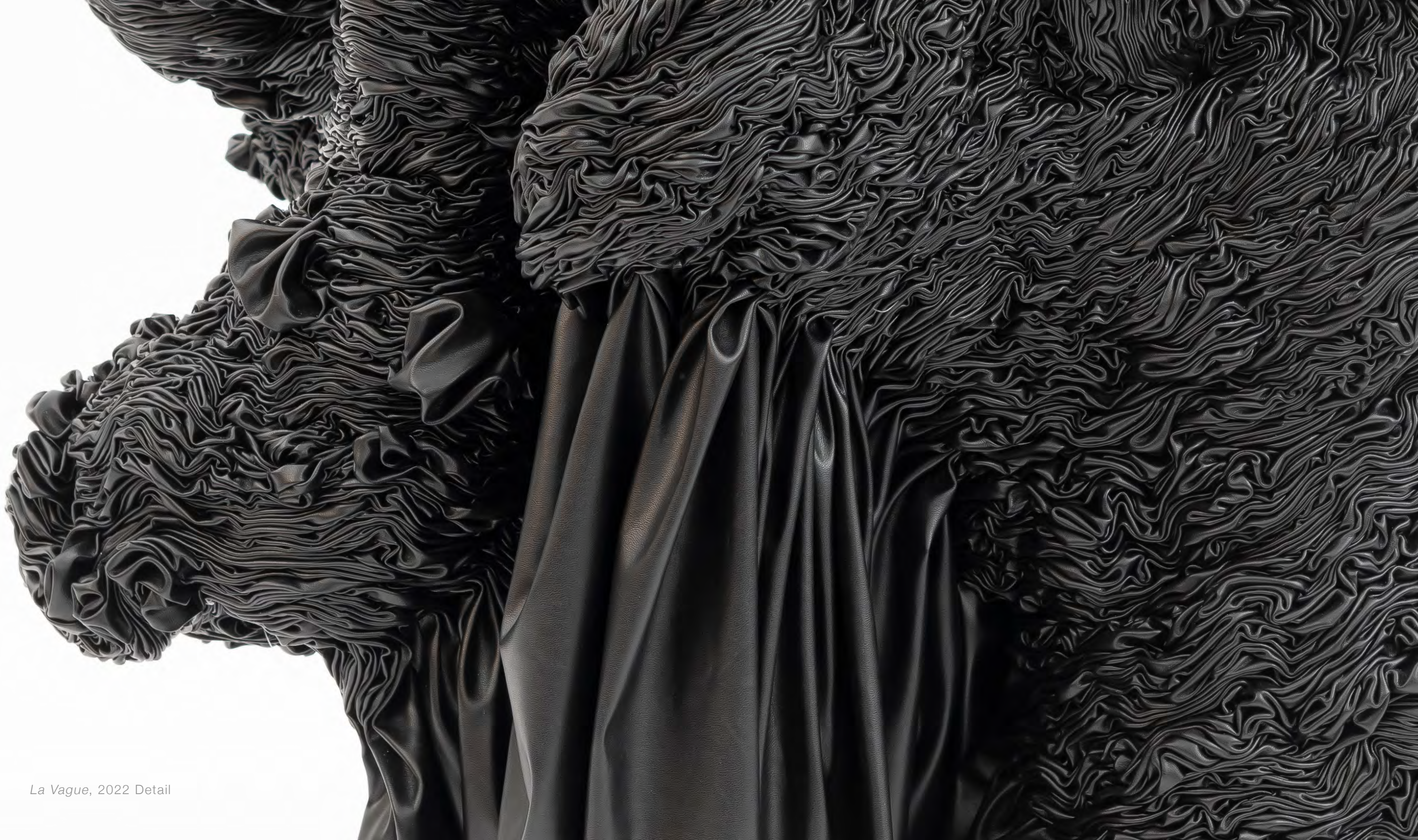
La Vague, 2022 Detail