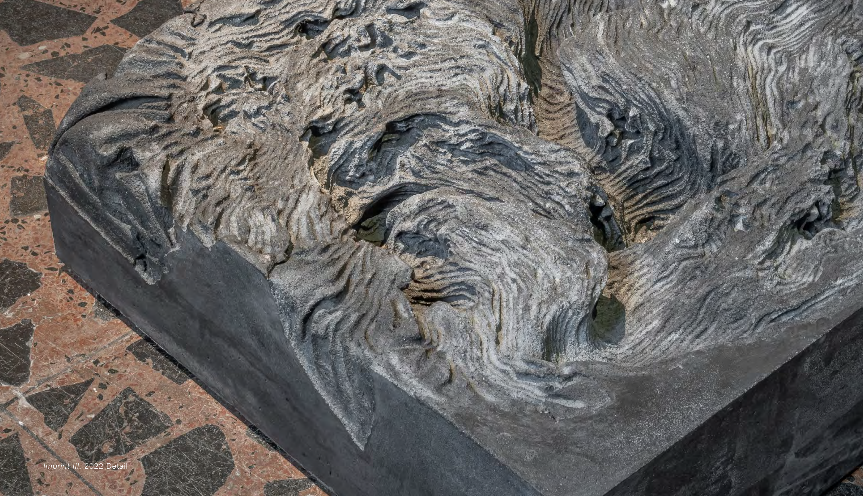
Imprint III, 2022 Detail