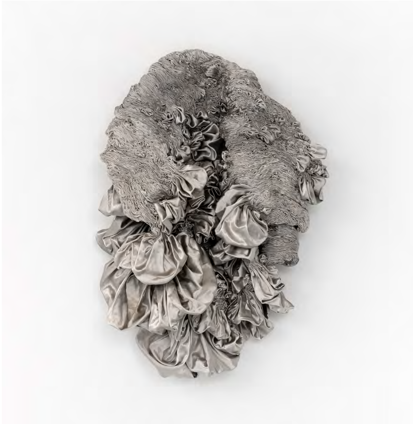
HANNE FRIIS Gorge II 2020 Natural dyed viscose; hand-stitched 90 x 60 cm Unique piece