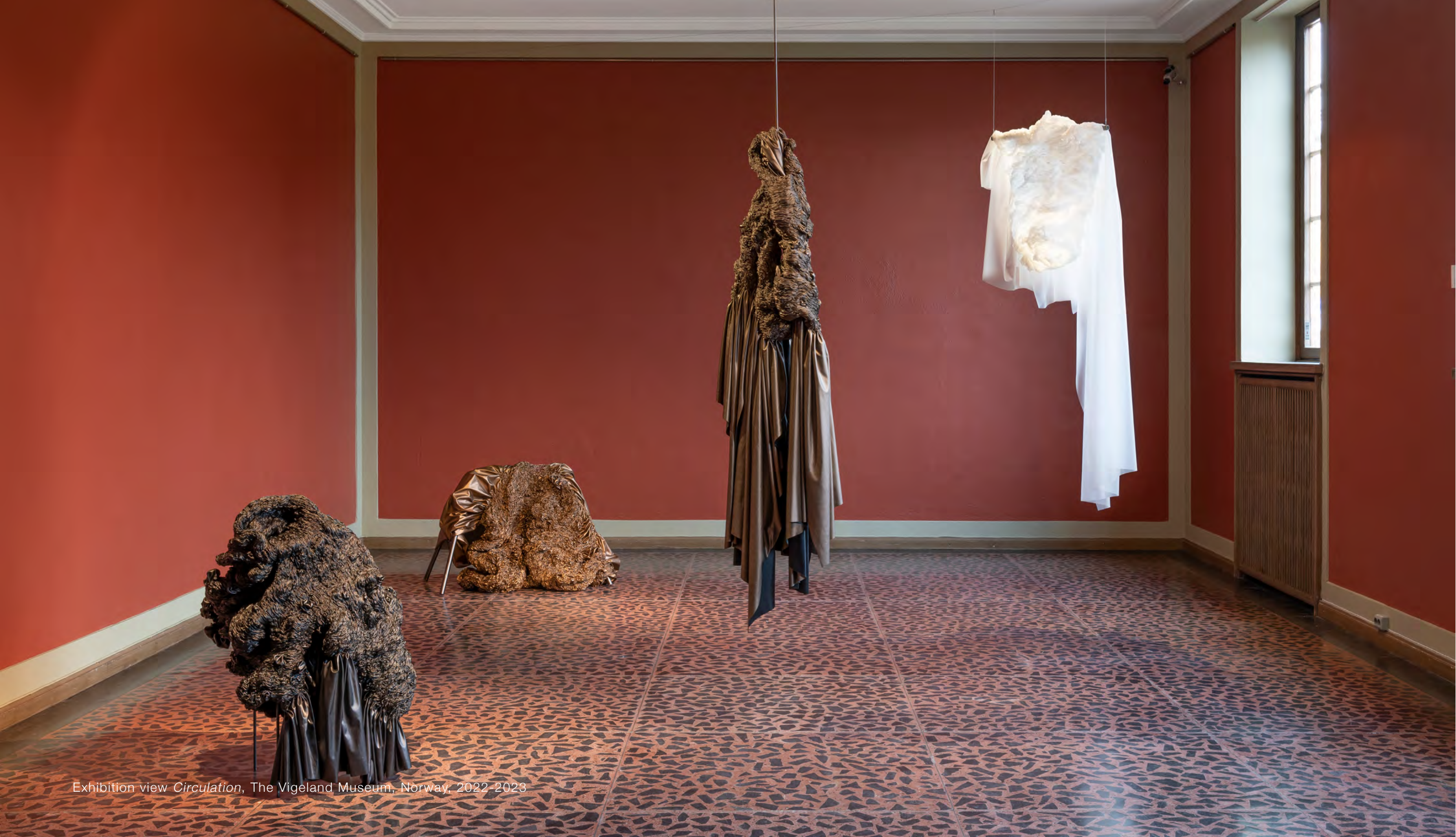
Exhibition view Circulation , The Vigeland Museum, Norway, 2022-2023