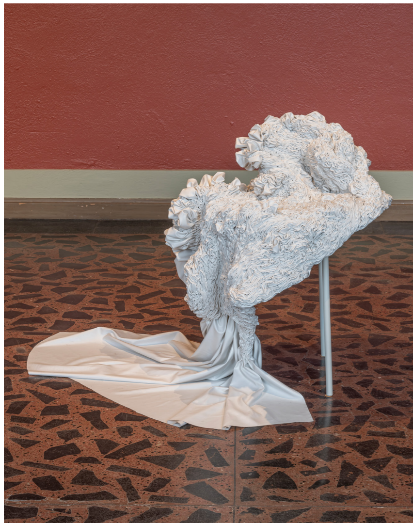
Hanne Friis, Flood , 2020-22, Imitation leather, steel; hand-stitched, 72 x 80 x 110 cm, unique piece.

seem to touch upon its primitive forms in an expressive interpretation that is both wild and controlled.