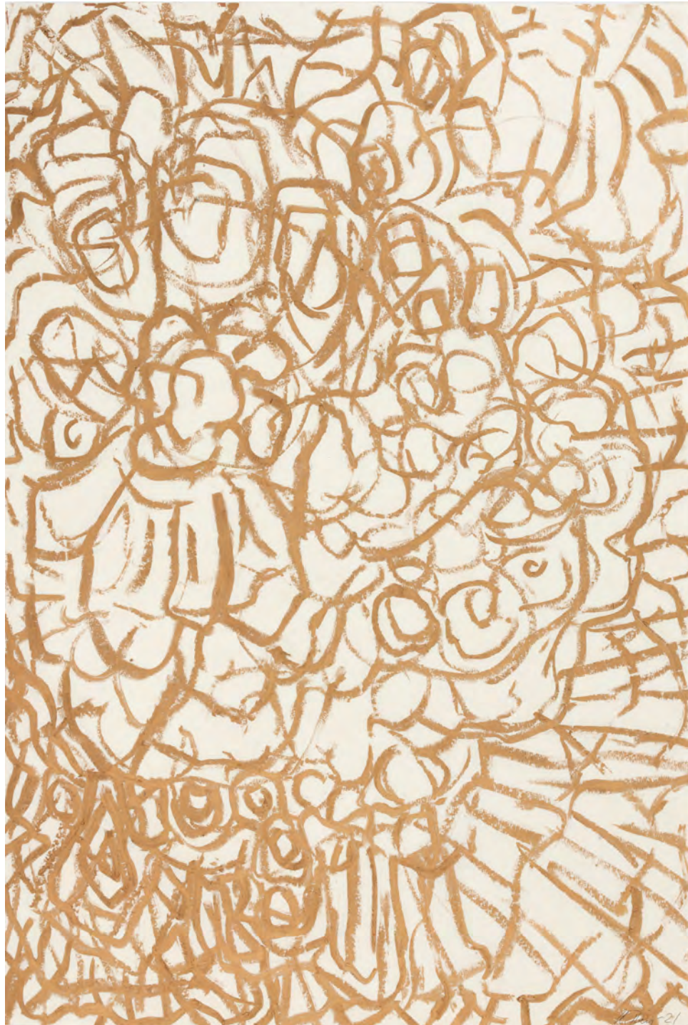
HANNE FRIIS Paris I 2021 Sennelier oil pastel on paper 101 x 69 cm (framed) Unique piece