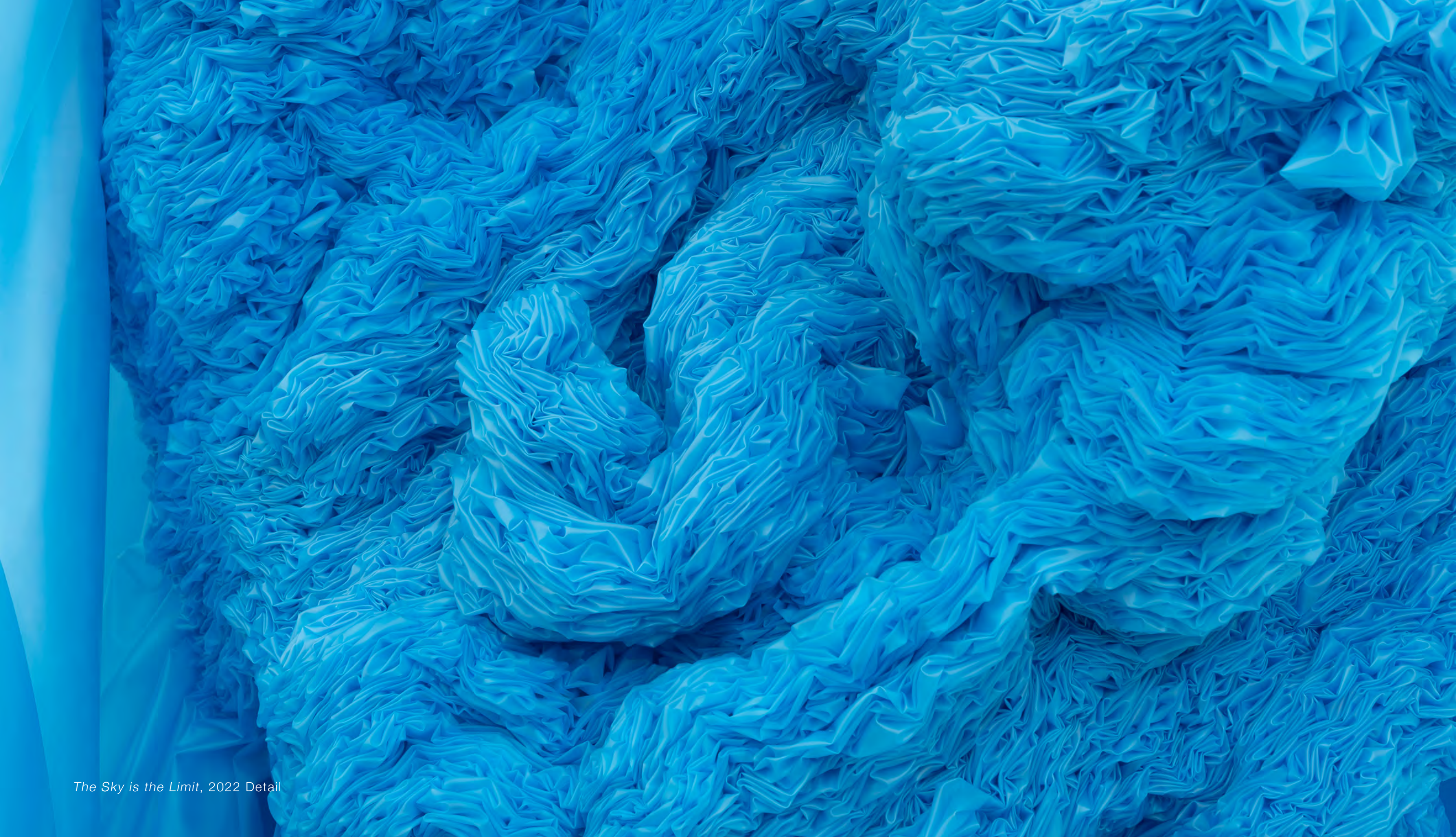
The Sky is the Limit, 2022 Detail