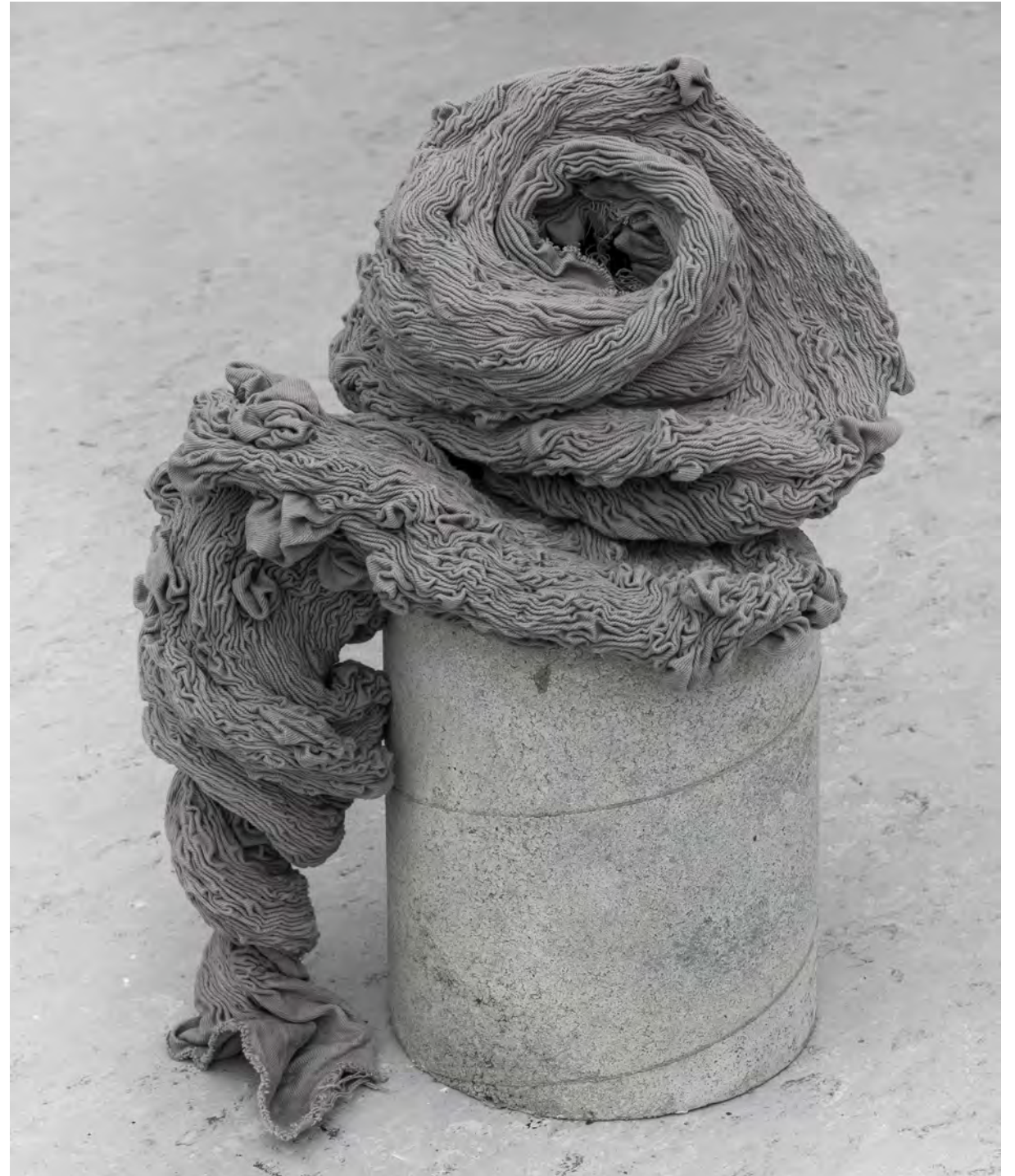
HANNE FRIIS Grey Monument II 2018 Cotton canvas dyed by oak acorn and iron mordant; hand-stitched 60 cm x 43 cm Unique piece