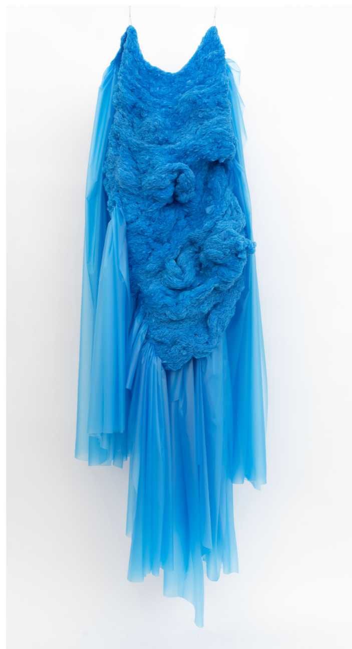
Hanne Friis, The Sky is the Limit , 2022, plastic; hand-stitched, 270 x 100 x 50 cm, unique piece. © Øystein Thorvaldsen

In the autumn of 2021, during the Covid 19 pandemic, Hanne Friis is at the Cité des Arts in Paris for four months. Her small flat near the Seine is overflowing with materials bought at the Sacre Coeur. She is preparing her solo exhibition at the Vigeland Museum, which will take place in 2022/23. Outside, the pandemic is in full swing. The homeless and their temporary beds are more visible and the artist notices the contrast between the nonchalant elegance of the city and its dilapidated streets. With the work Helvete ('Hell') by the artist Gustav Vigeland in mind, she visits the Rodin Museum and contemplates The Gates of Hell . In a creative outburst, Friis creates about fifteen works over a period of twelve months for her exhibition at the Vigeland Museum, acclaimed by the critics. From 1 April to 17 June, Galerie Maria Wettergren will present a selection of important works from the Vigeland Museum together with other major pieces in the exhibition Torrent . The title of the exhibition refers to the movements, fluids, forces and transformations that are at the very core of Friis's work.