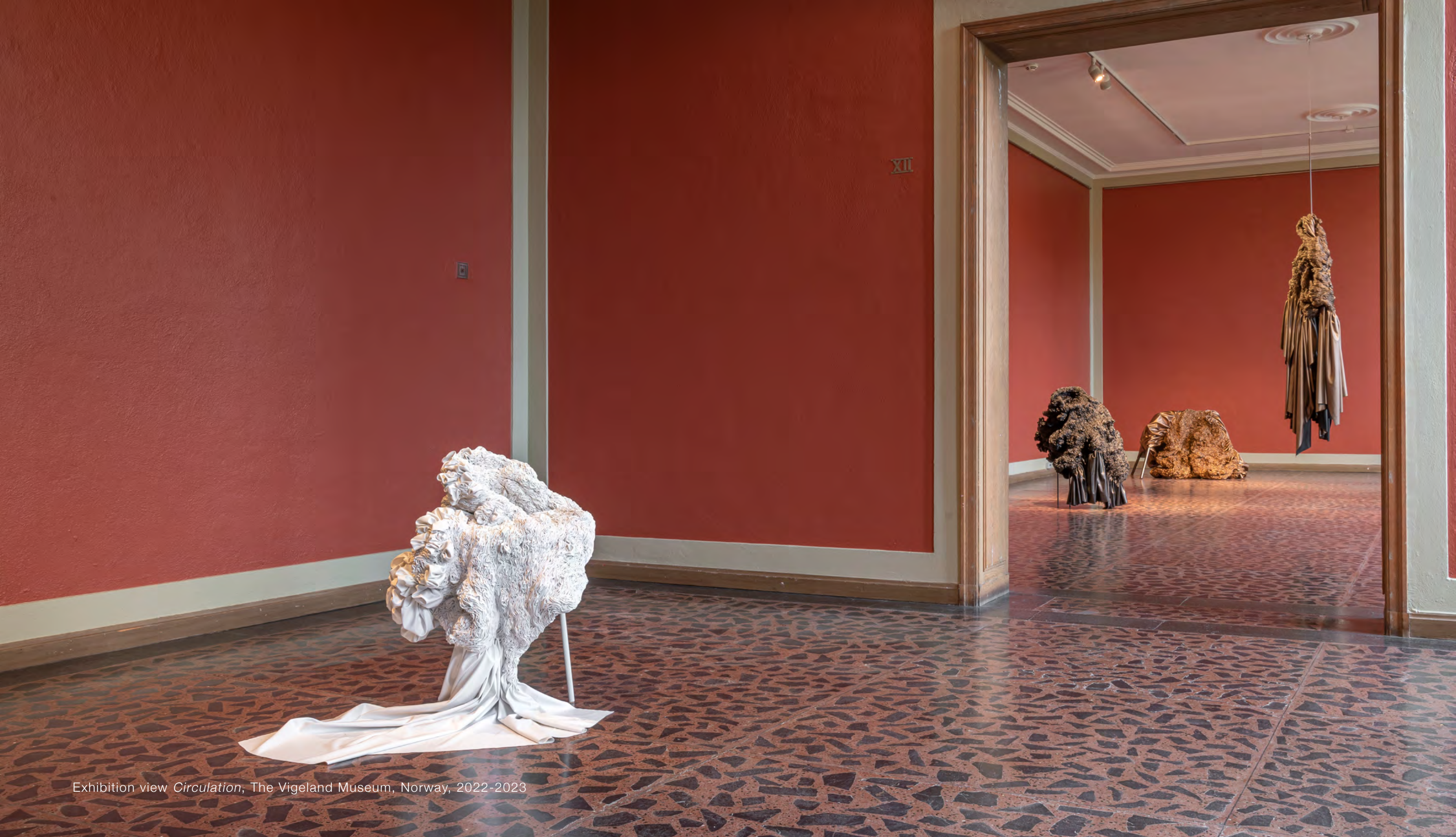
Exhibition view Circulation , The Vigeland Museum, Norway, 2022-2023