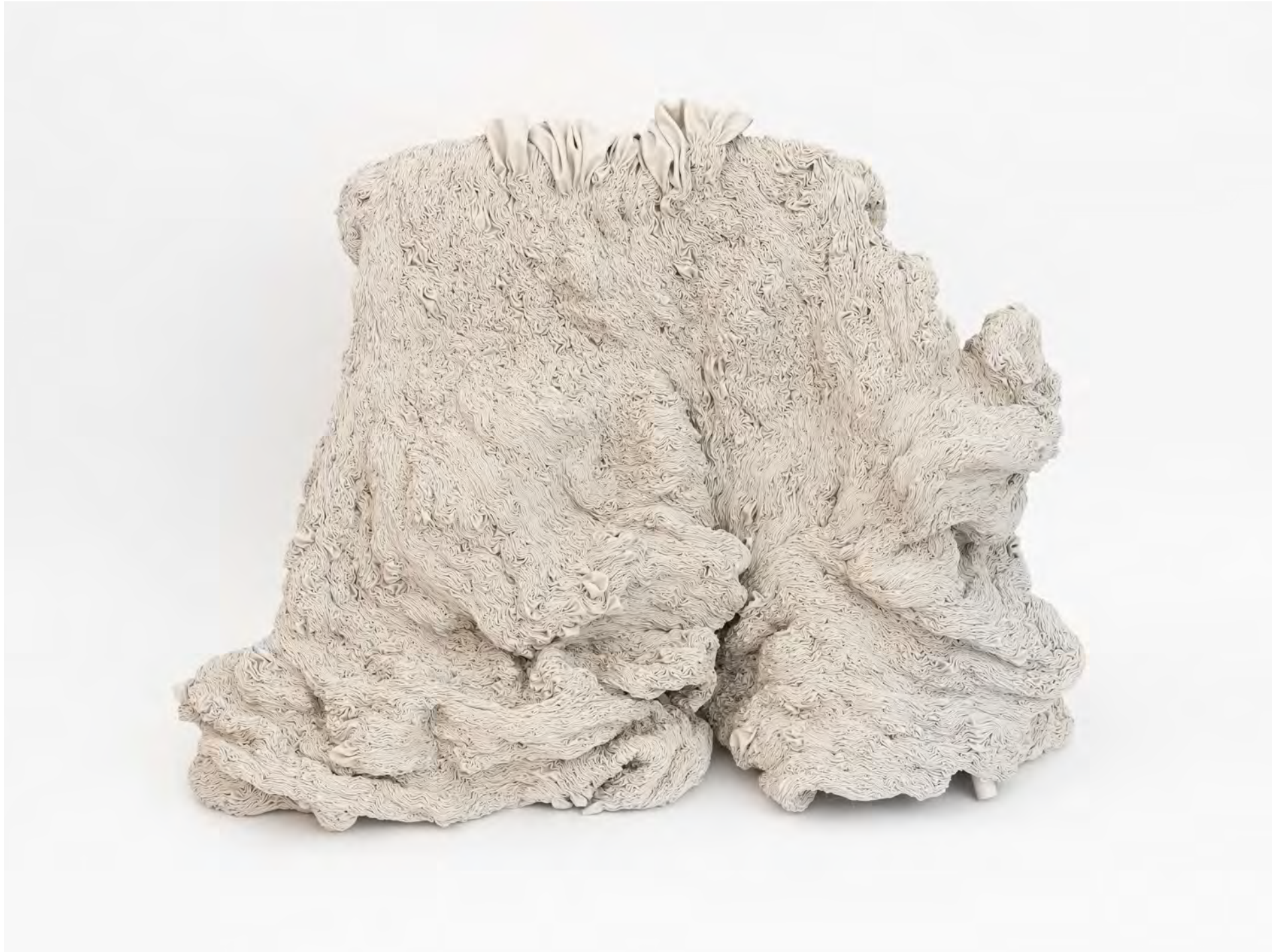
HANNE FRIIS The Mountain 2022 Faux leather, steel; hand-stitched 96 x 138 x 96 cm Unique piece