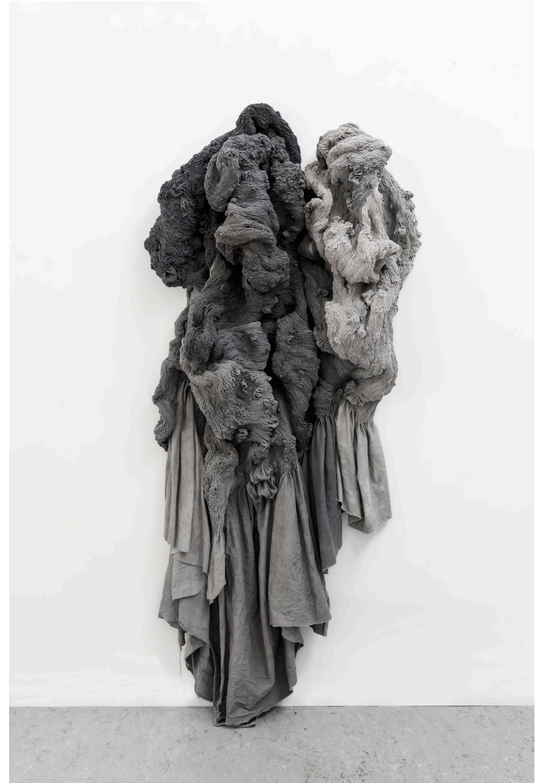
The Juice From the Trees II, 2019