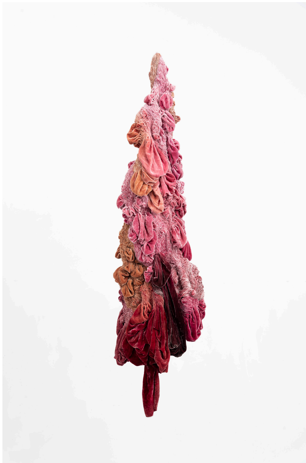
New Ornaments IV (The Silk Series) , 2015-18