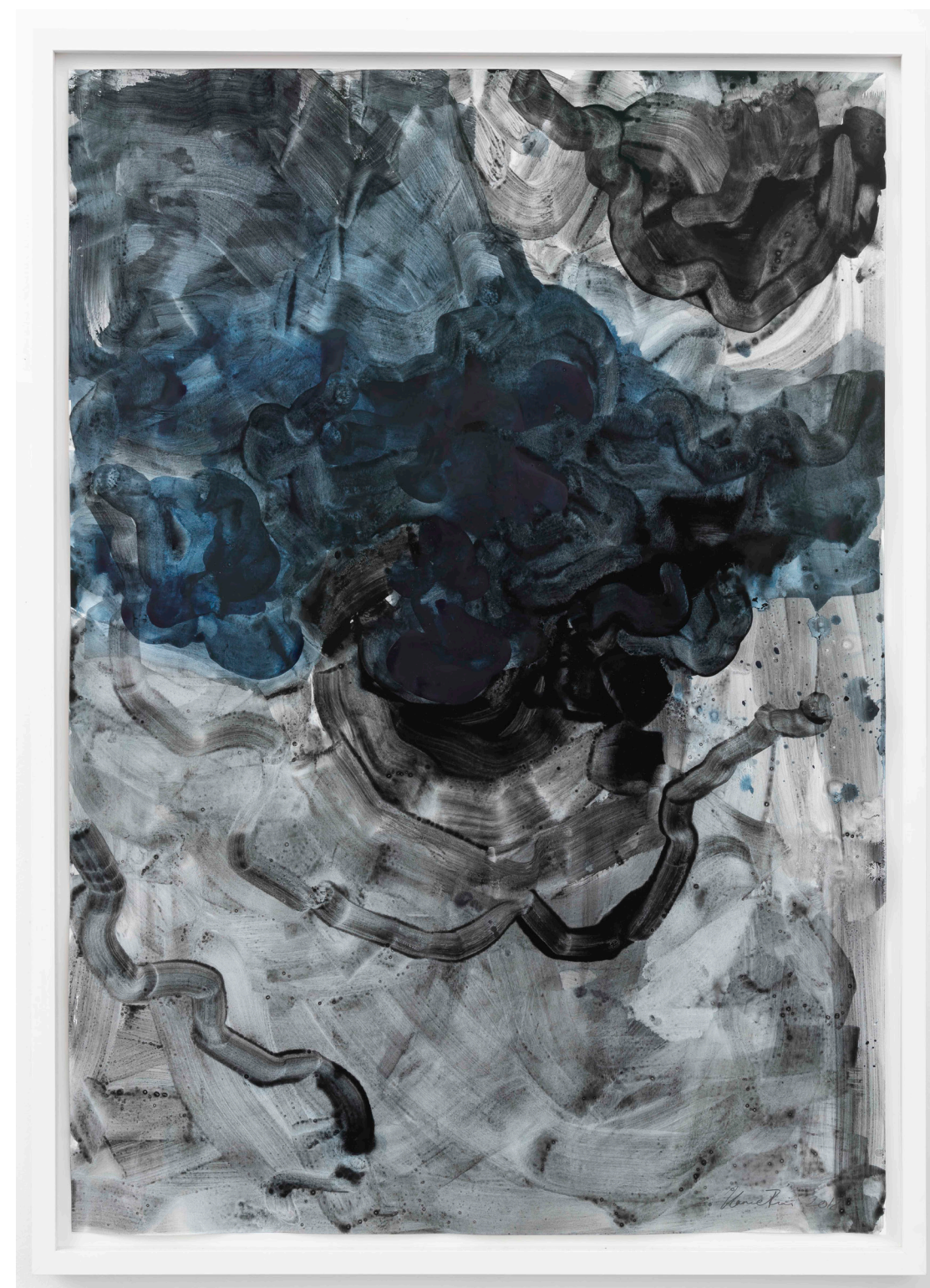
Dark Part , 2018 106 x 76 cm Acrylic on paper/glass and frame