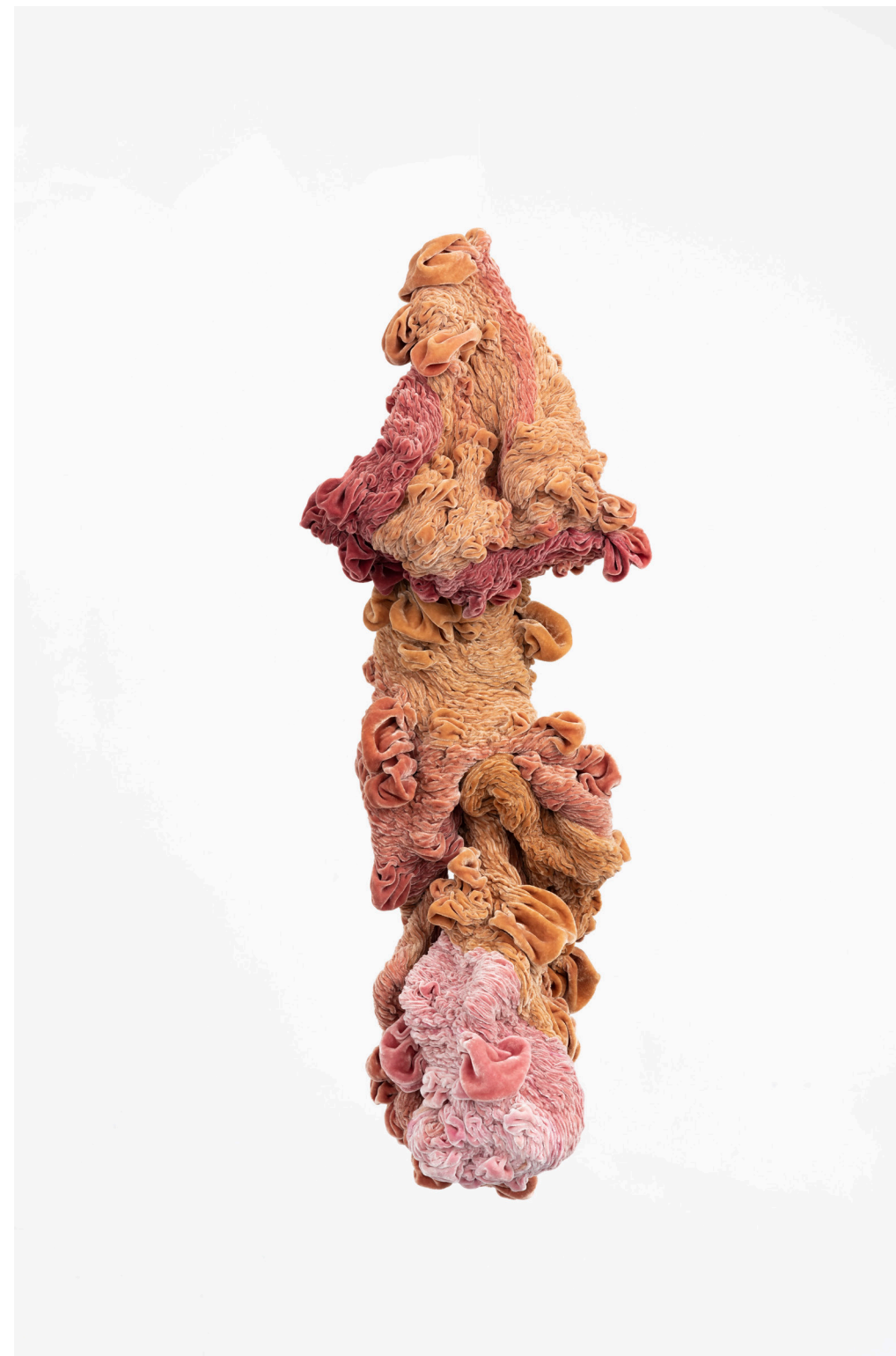
New Ornaments II (The Silk Series) , 2015-18

Silk velvet dyed by cones and cochineal, sewn by hand