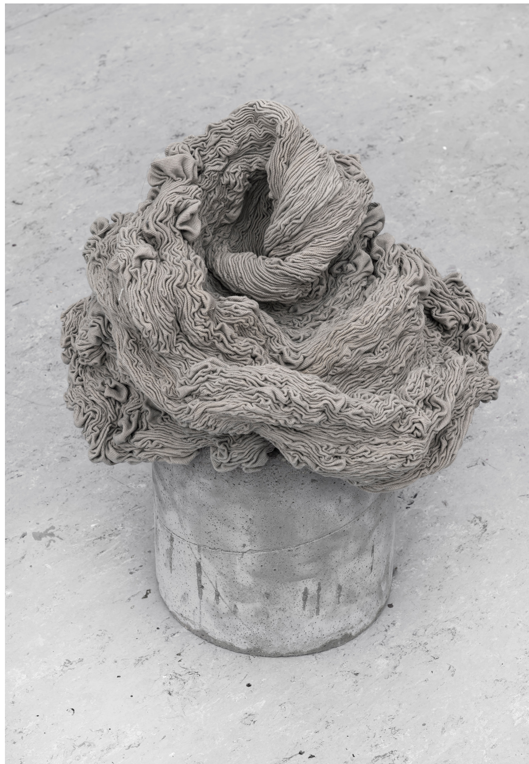
Grey Monument I, 2018