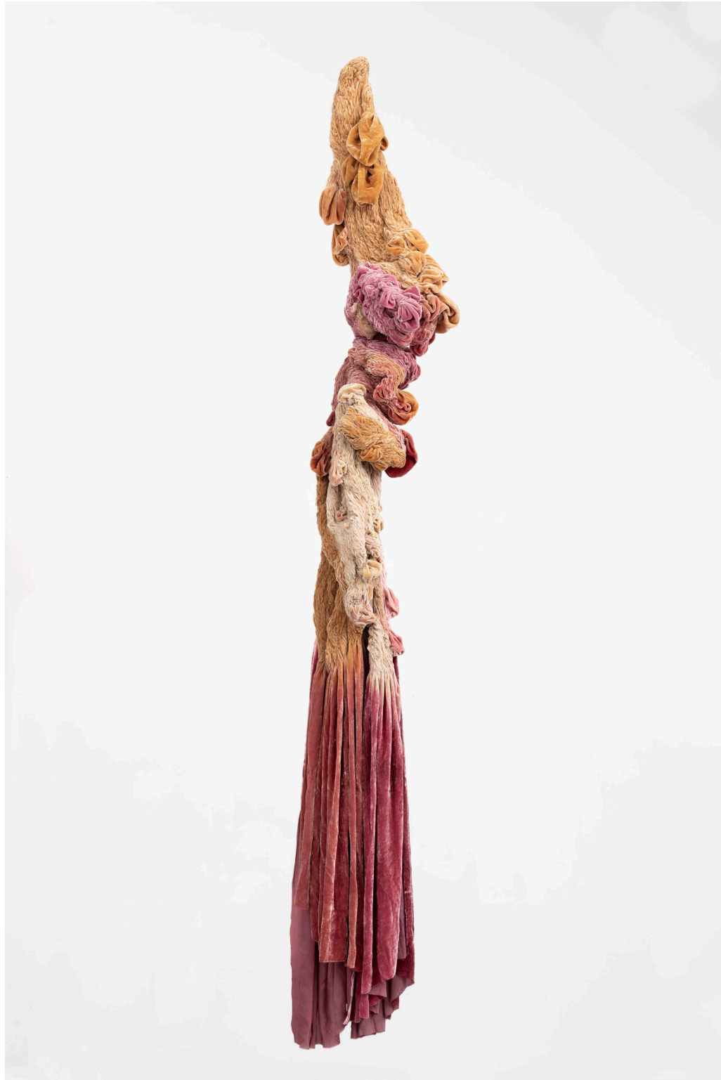
New Ornaments I (The Silk Series), 2015-19