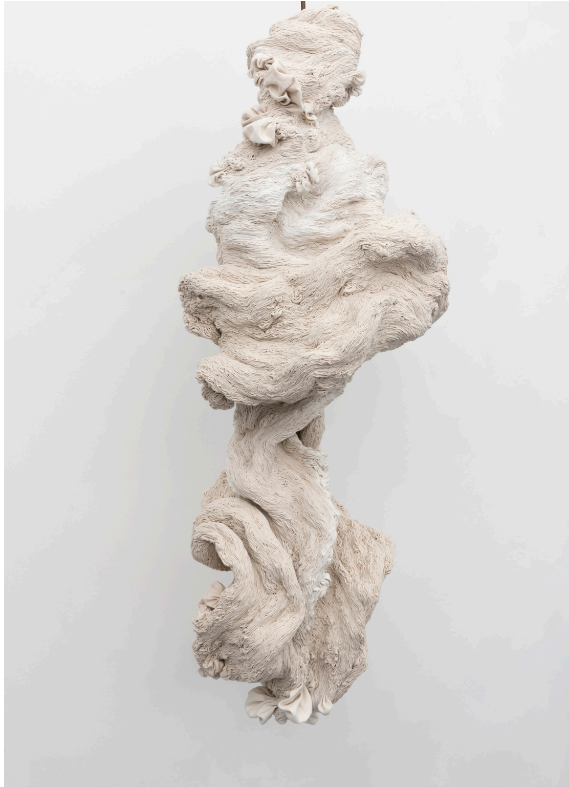
Spiral I , 2018