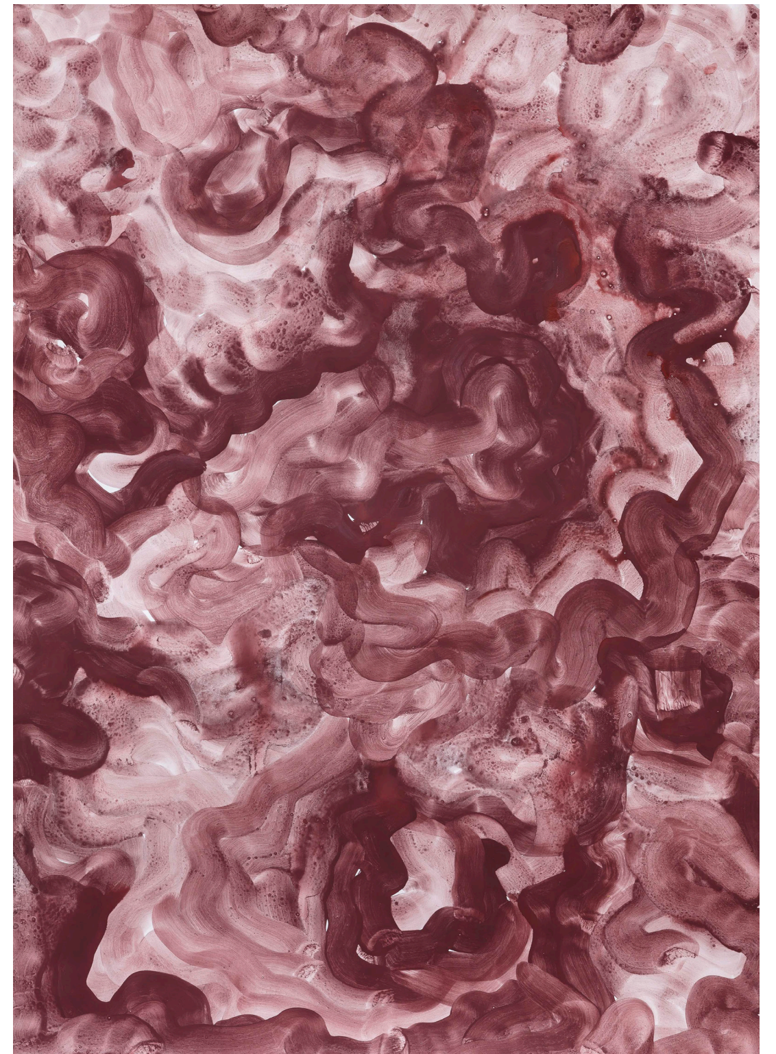
Worthless Remains II , 2018

106 x 76 cm Acrylic on paper/glass and frame