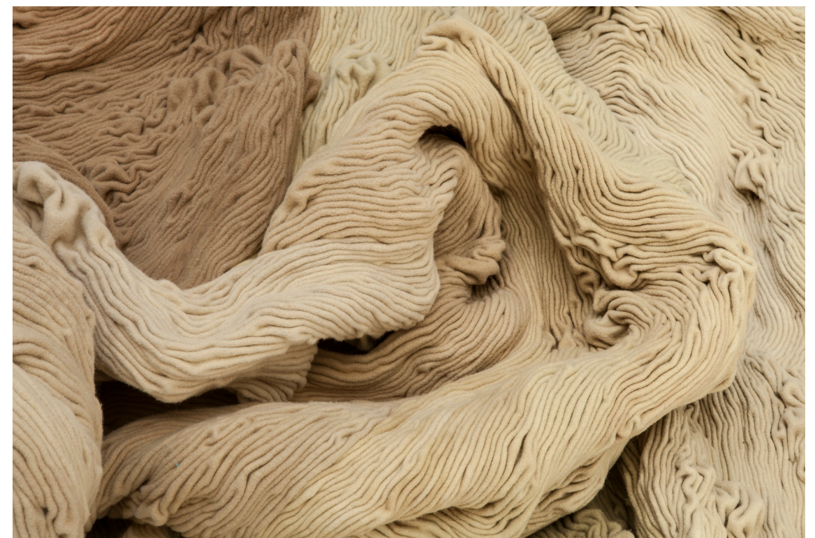
Burden , 2014-16

Diameter 200cm Wool dyed by mugwort, sewn by hand