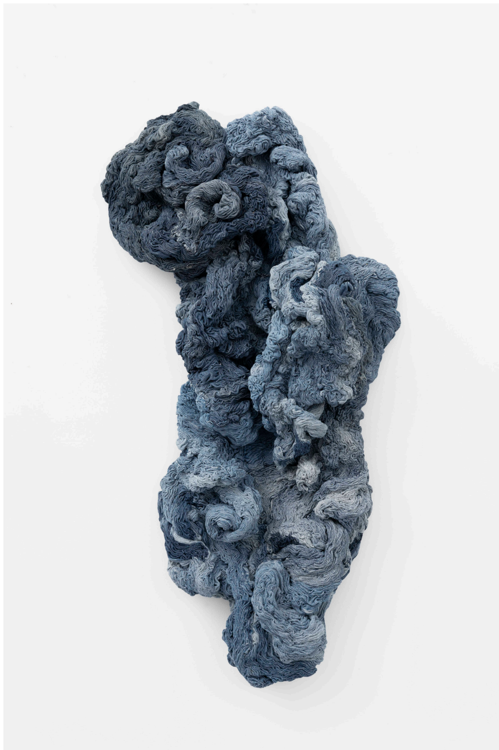
Secrets (Blue) , 2008 117 x 50 x 24 cm Denim, sewn by hand