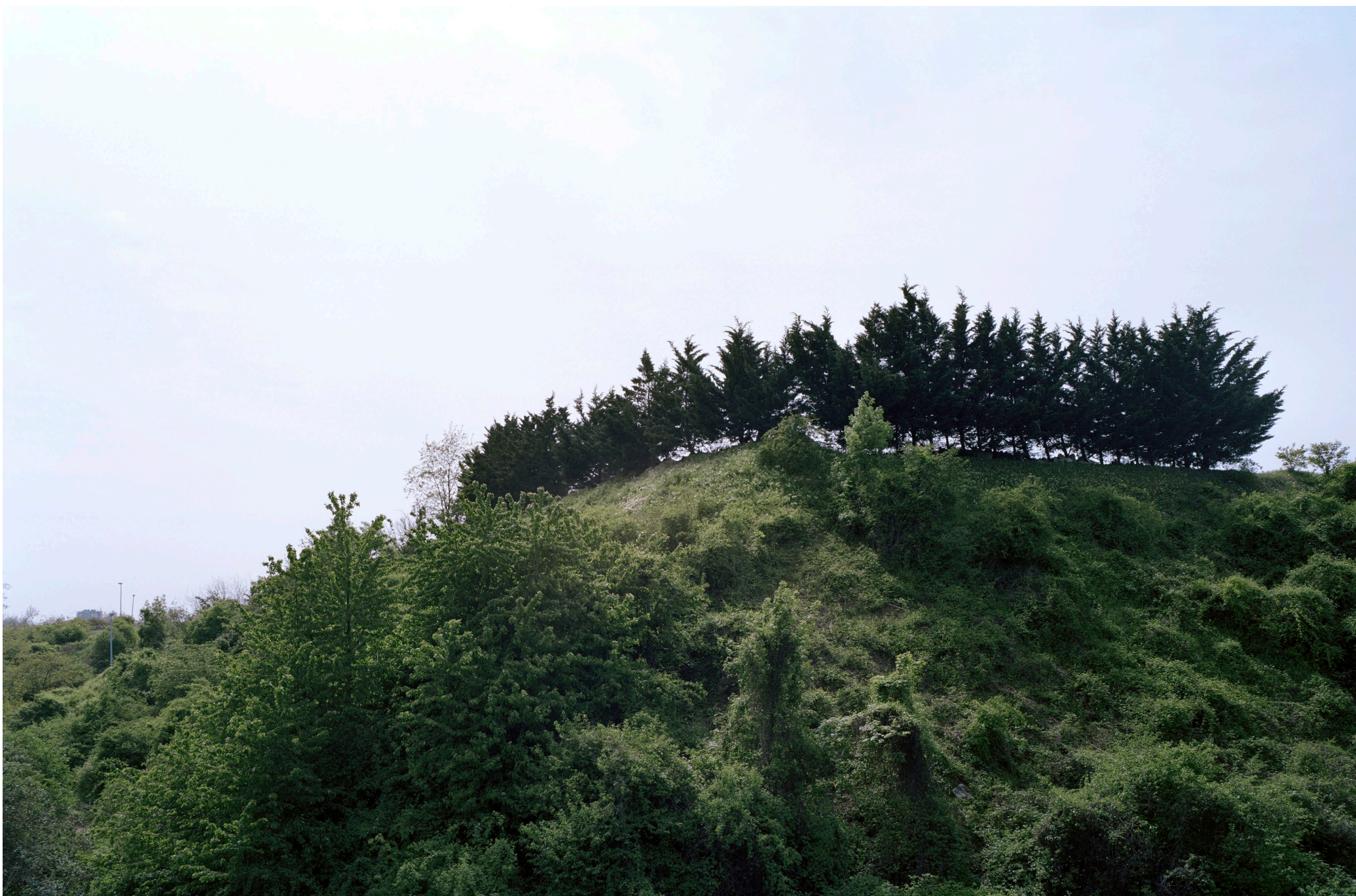
BENOÎT FOUGEIROL Aulnay sous Bois 2006 Silverprint photography 80 x 120 cm Limited edition of 8