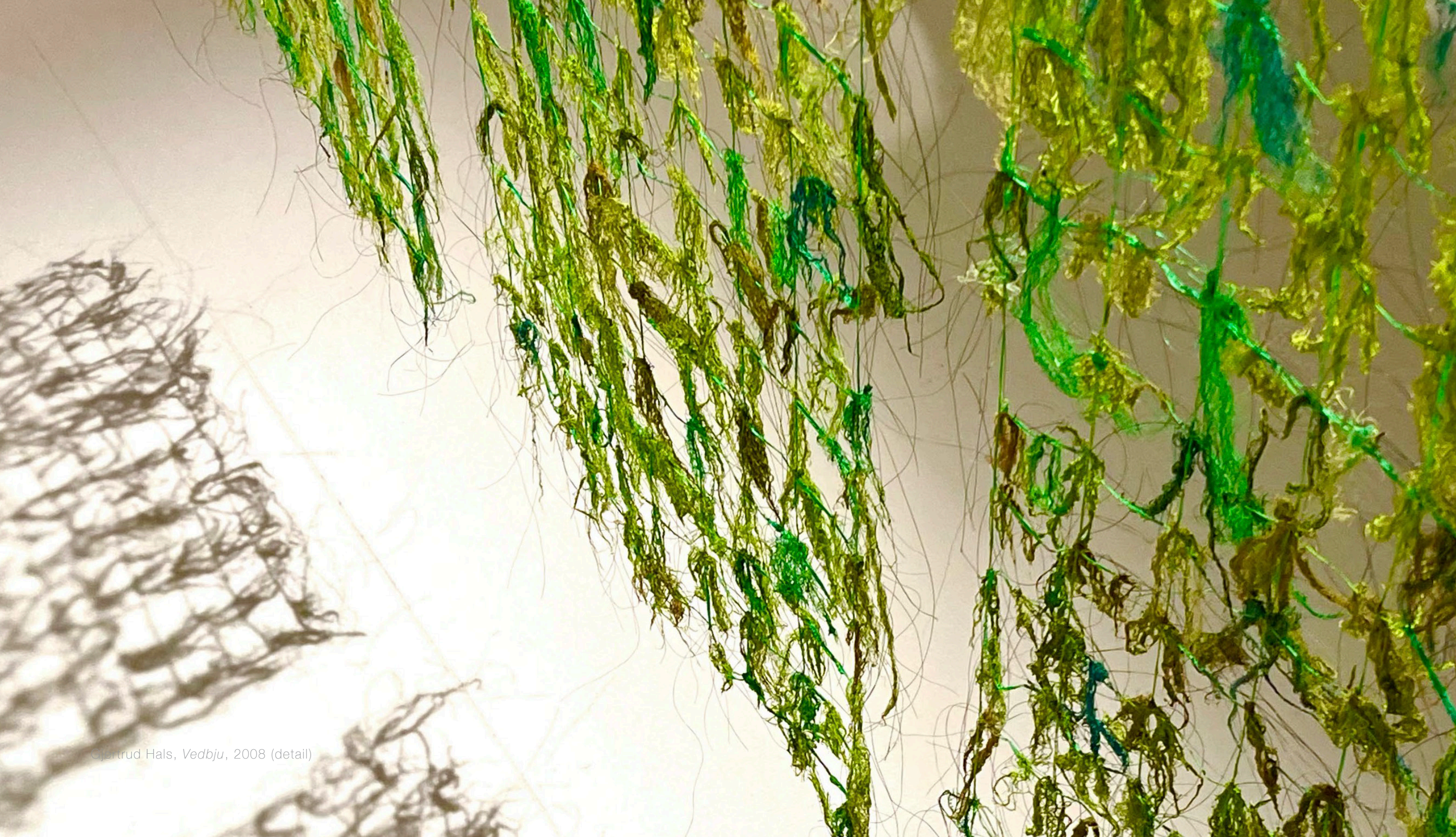
Gjertrud Hals, Vedbjø , 2008 (detail)