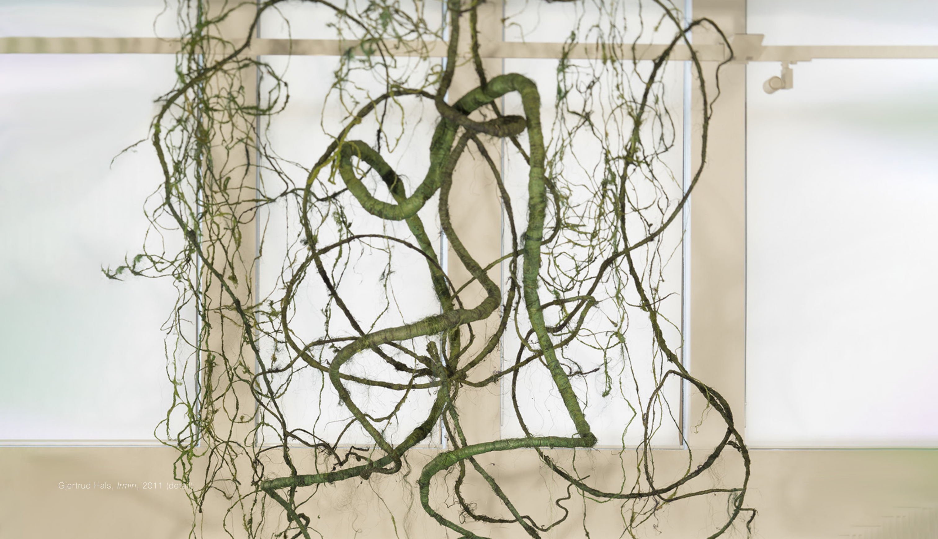
Gjertrud Hals, Irmin , 2011 (detail)