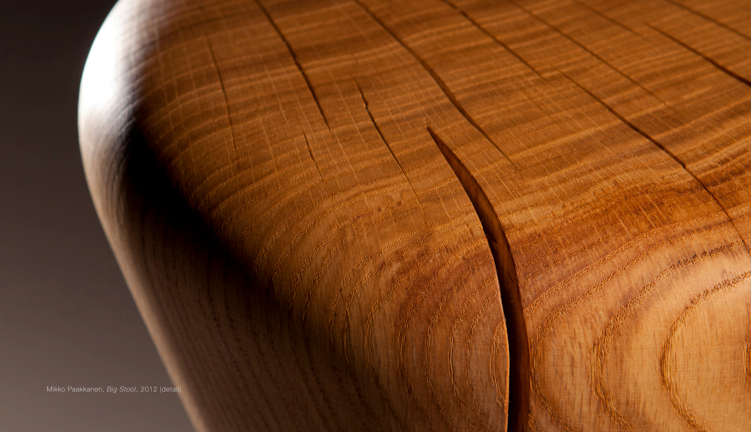
Mikko Paakkanen, Big Stool , 2012 (detail)