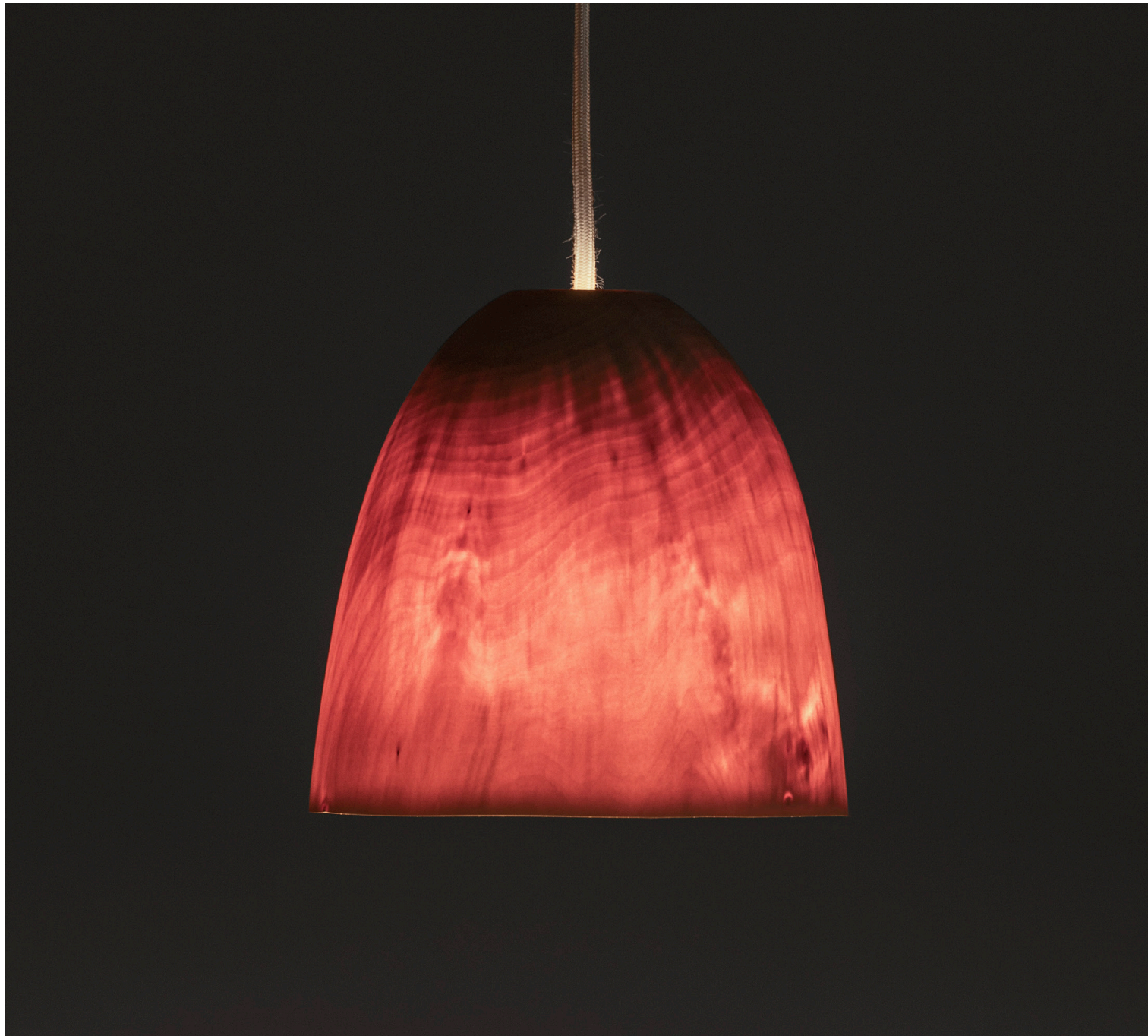
AKIKO KUWAHATA & KEN WINTHER Trælys 3 2019 Birch Ø18 x 17,5 cm Unique piece