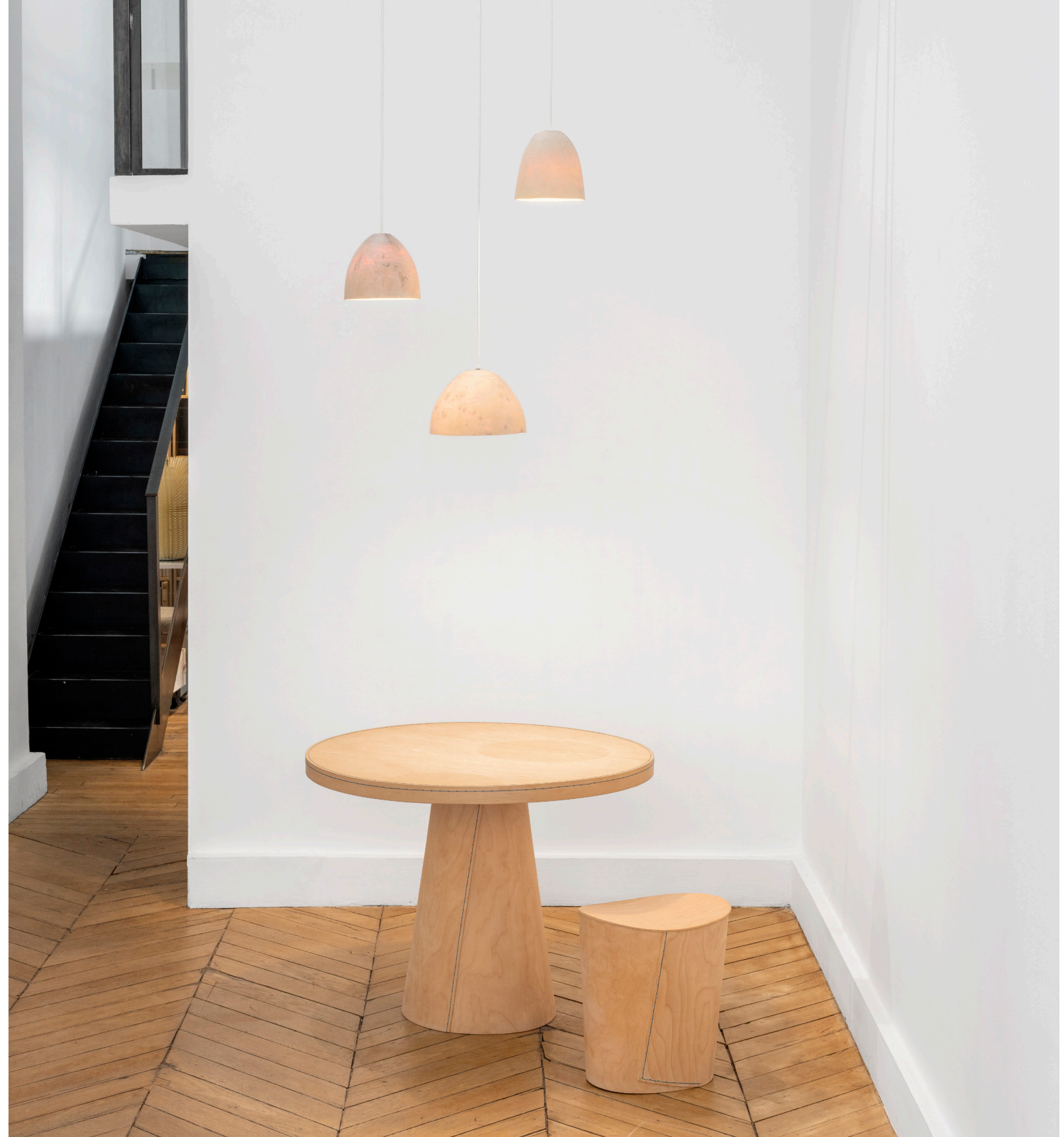
Akiko Kuwahata & Ken Winther, Trælys lamps , 2019 (exhibition view)