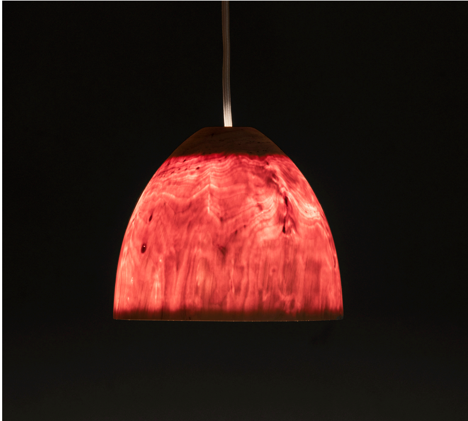
AKIKO KUWAHATA & KEN WINTHER Trælys 1 2019 Birch Ø19 x 16,5 cm Unique piece