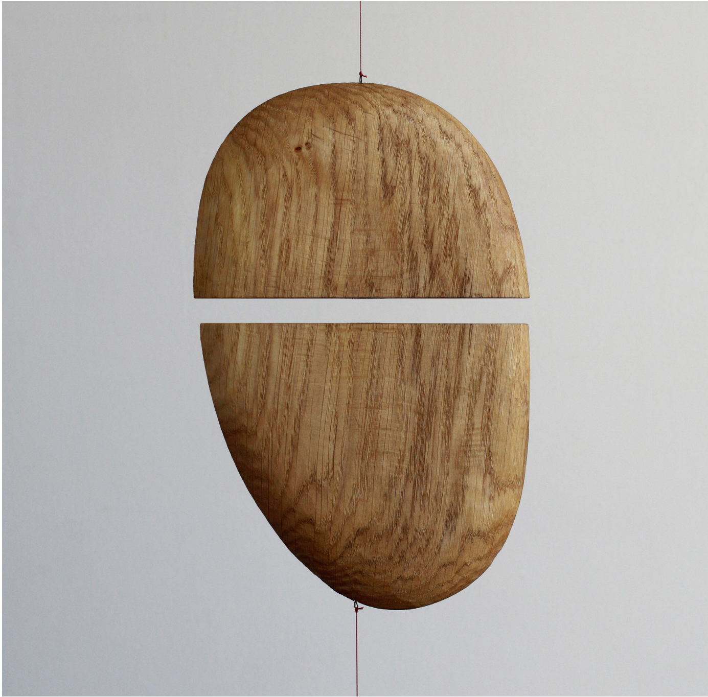
ESKE REX Divided Self XII 2017 Oak, leash, magnets 31 x 19 x 3 cm Unique piece