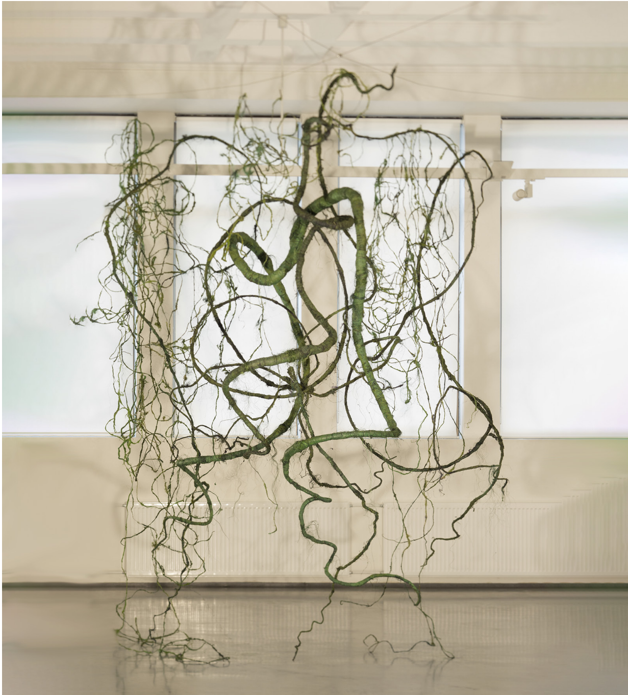
GJERTRUD HALS Irmin 2011 Metal thread, fabric, thread, fiber Variable dimensions Unique piece