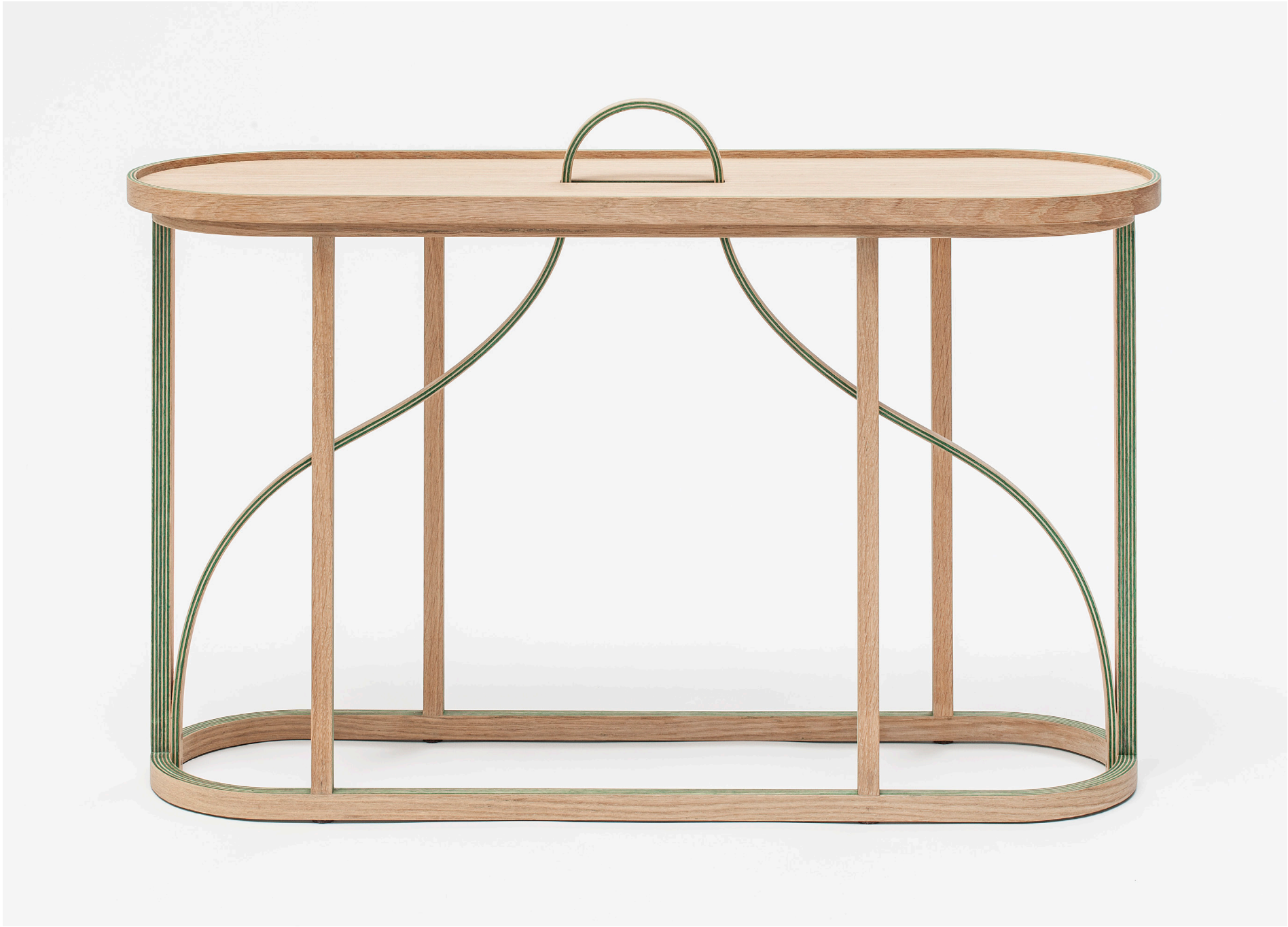
AKIKO KUWAHATA & KEN WINTHER Tram, Green 2015 Oak, dyed birch 80 x 26 x 53,5 cm Limited edition of 12