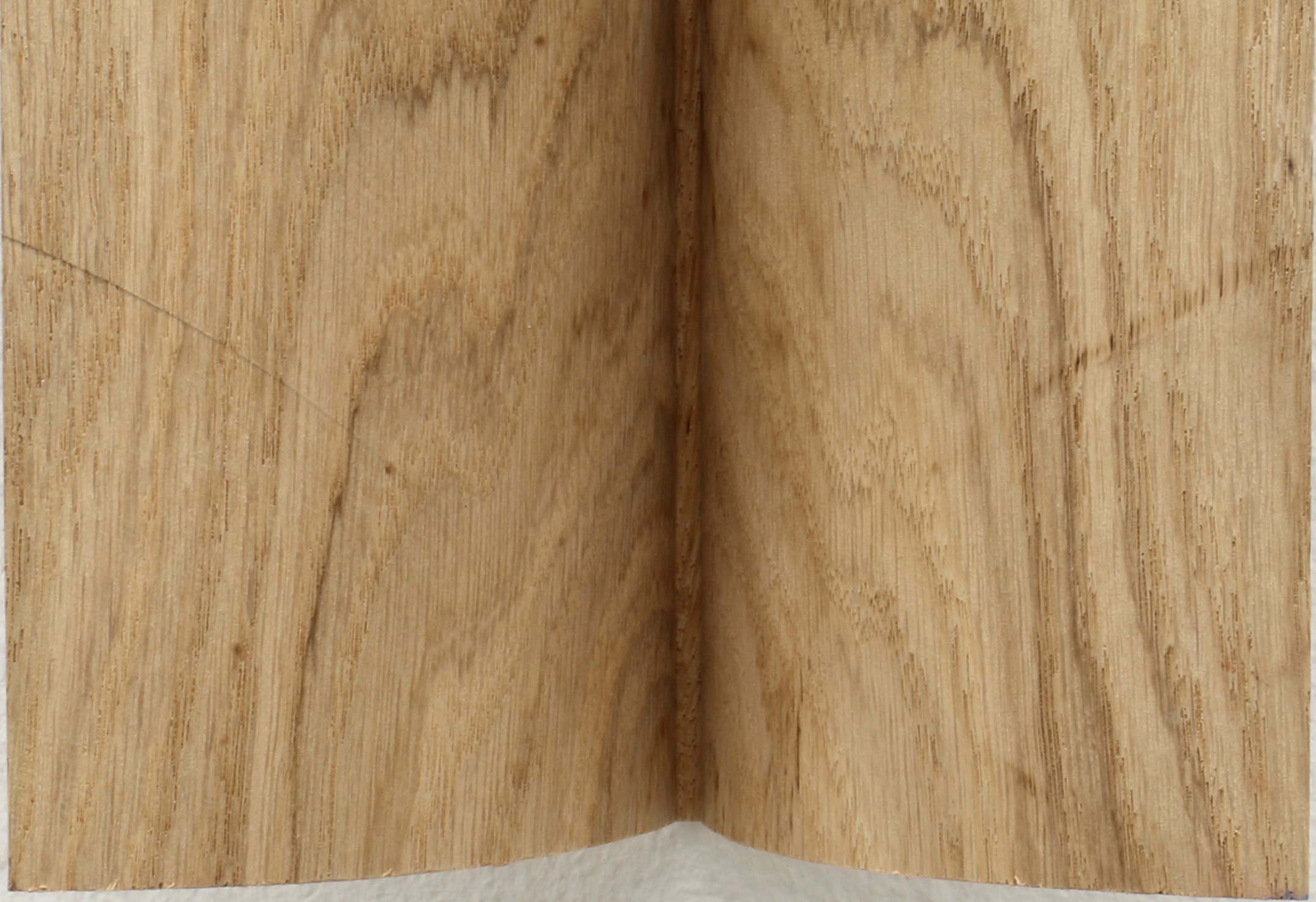
Eske Rex, Book IV , 2019 (detail)