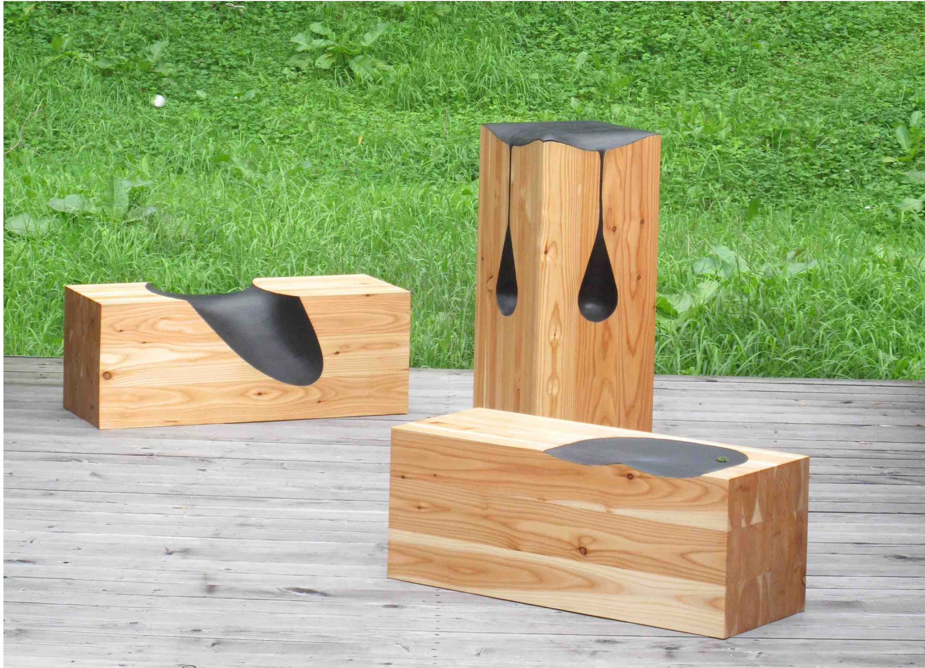
MIKKO PAAKKANEN Kasane 2014 Solid pine, black ink 25 x 30 x 82 cm Limited edition of 12