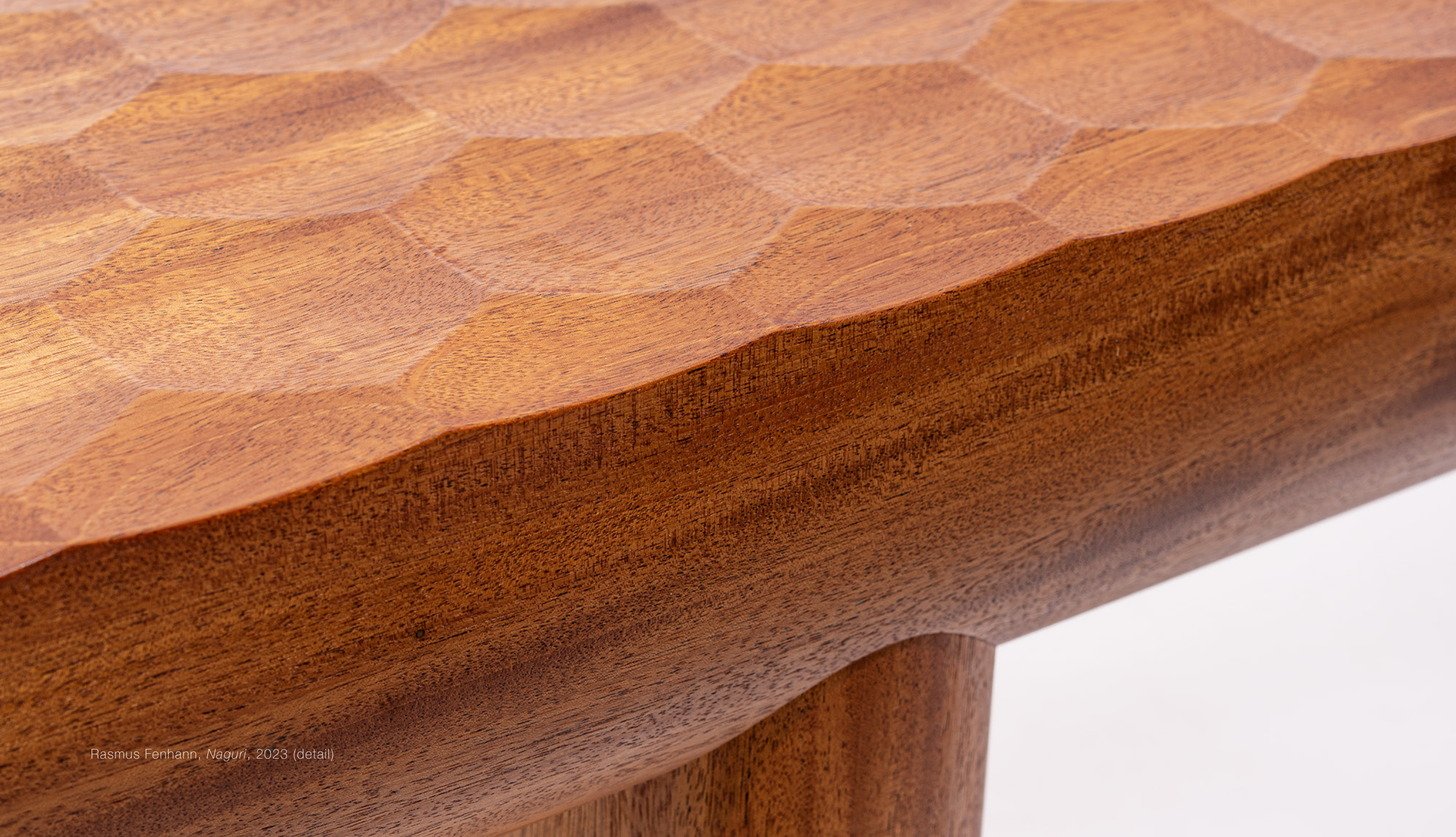
Rasmus Fenhann, Naguri , 2023 (detail)