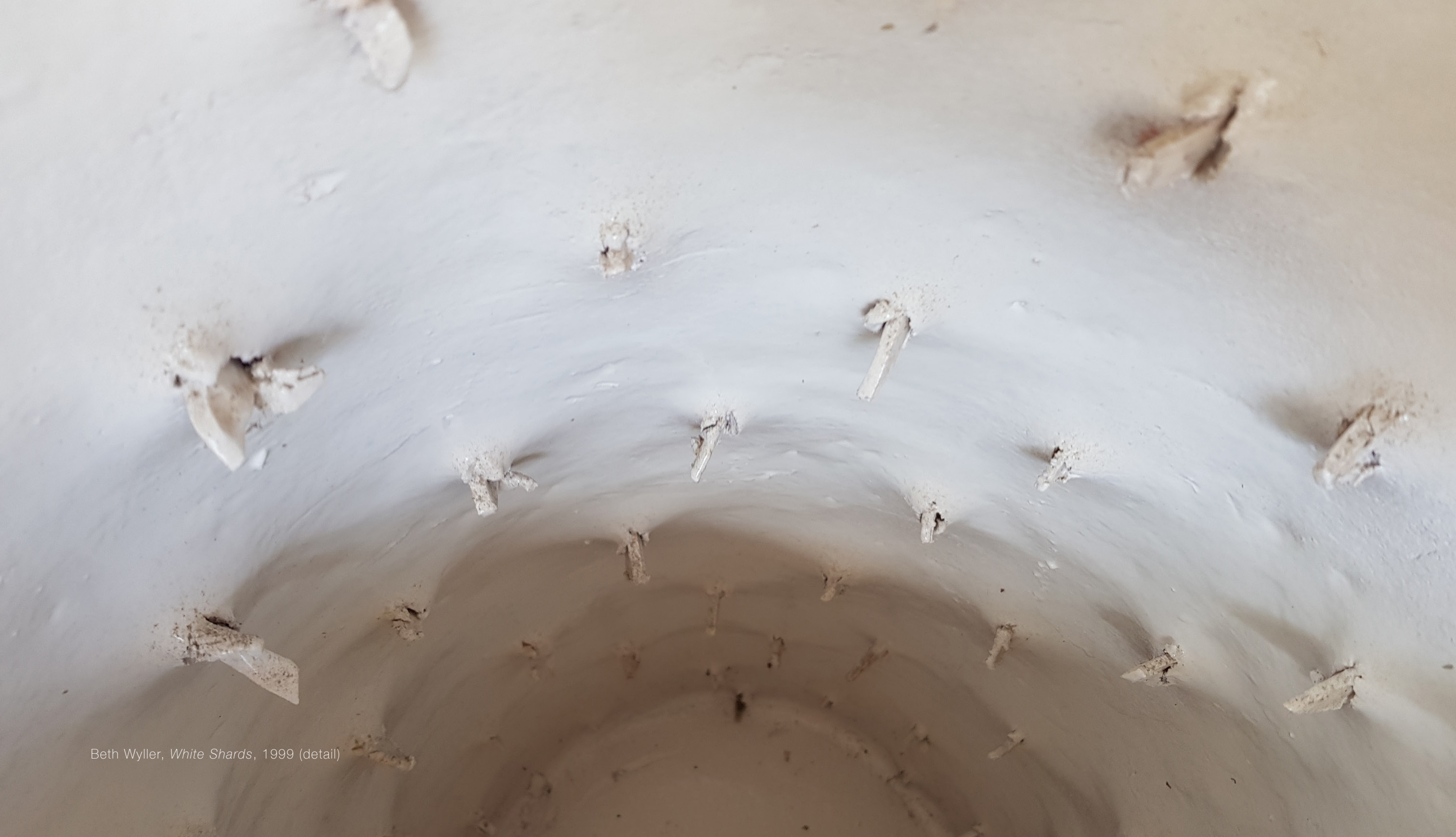
Beth Wyller, White Shards , 1999 (detail)