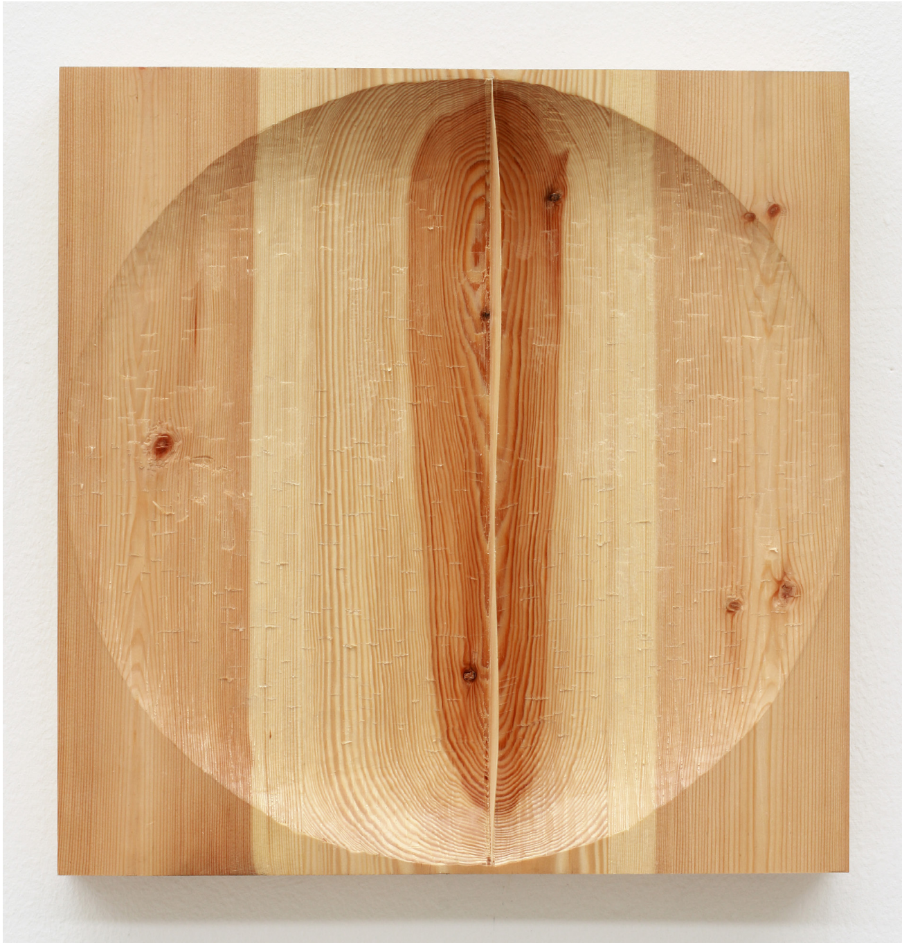
ESKE REX Untitled. Divided Circle 2018 Pine 38 x 38 x 4,5 cm Unique piece