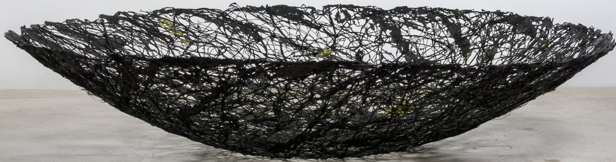
Gjertrud Hals, Urd I , 2008 (exhibition view)