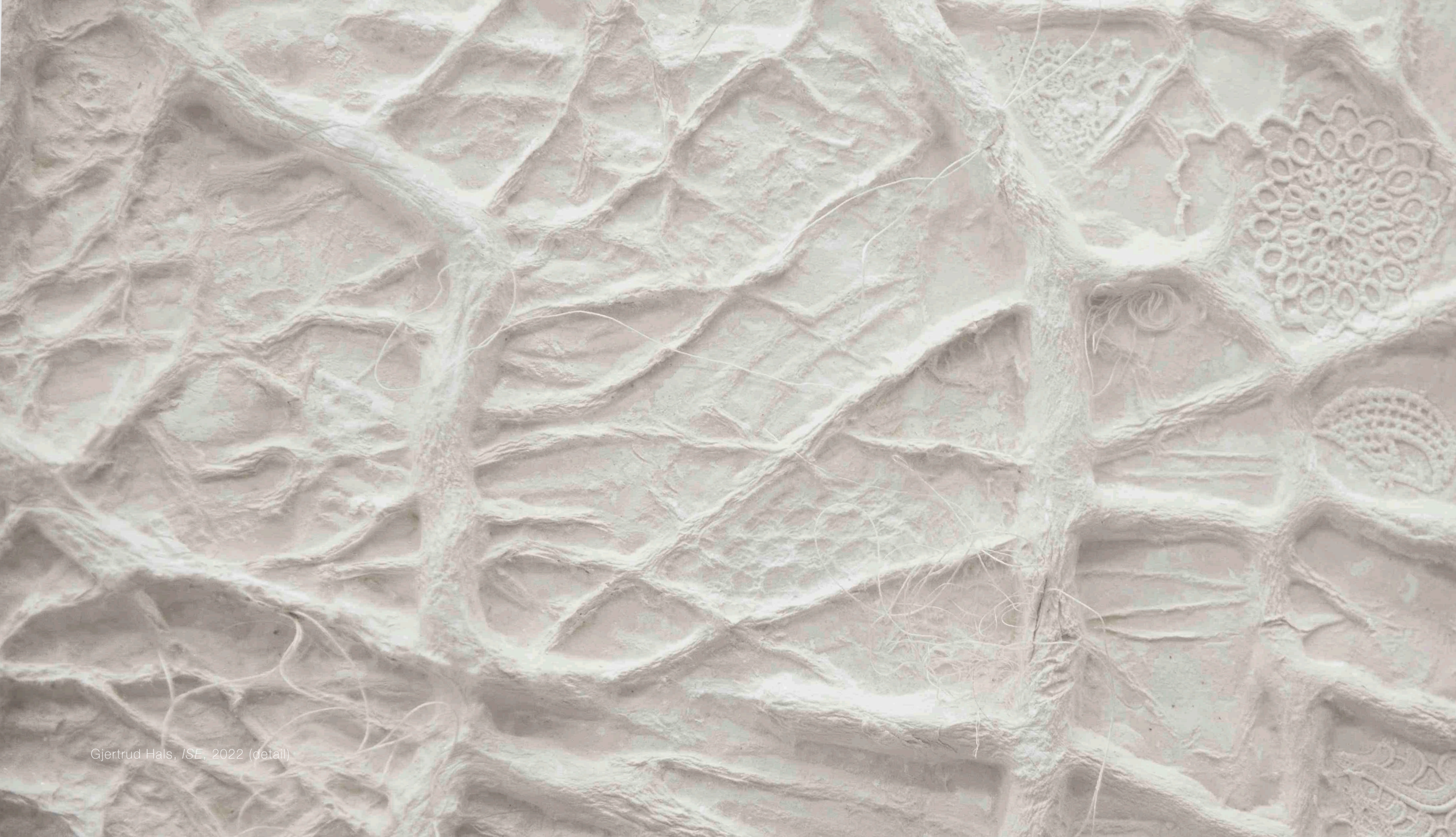
Gjertrud Hals, ISE , 2022 (detail)