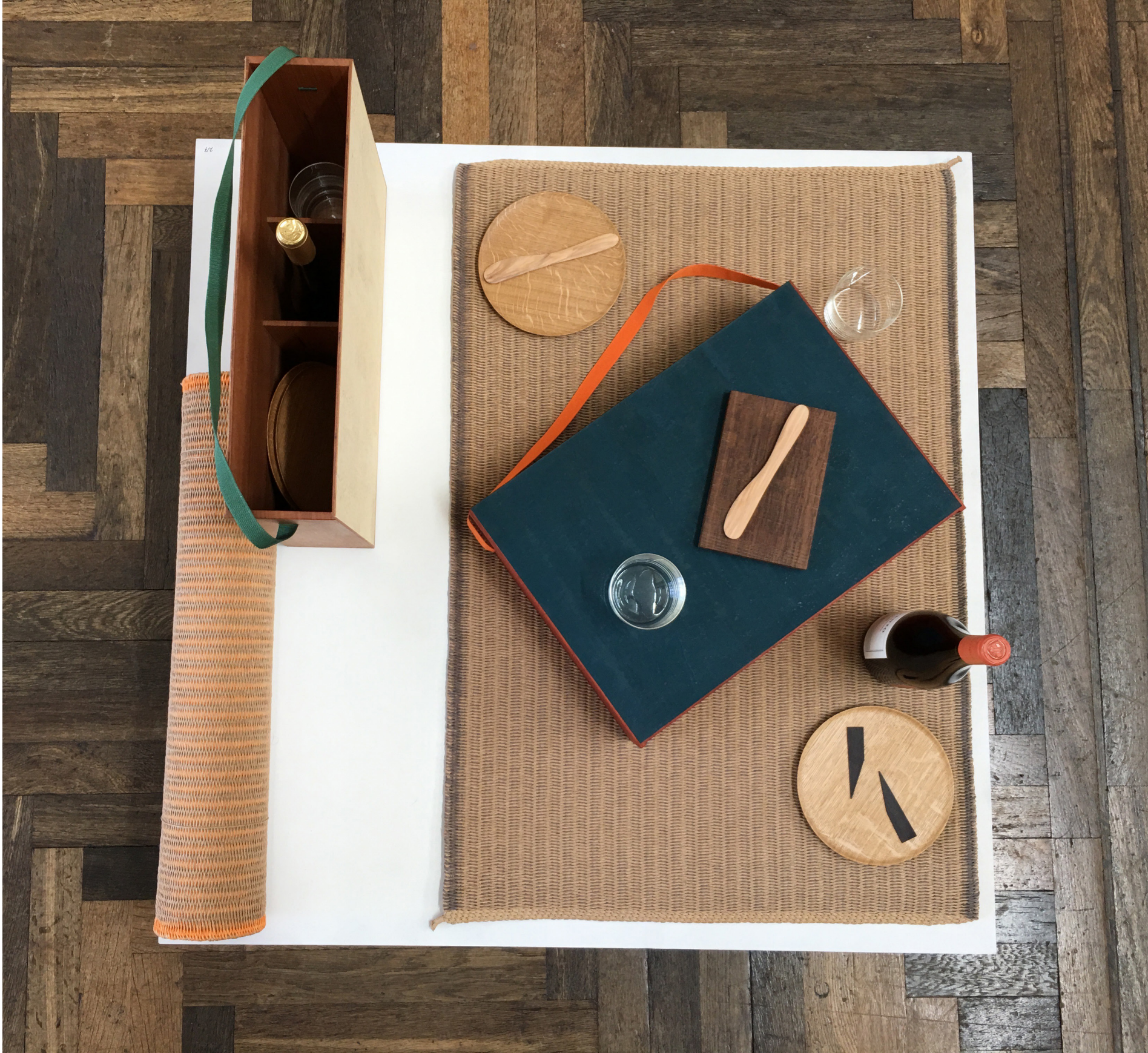
Akiko Kuwahata & Ken Winther, Picnic for 2 , 2017 (exhibition view)