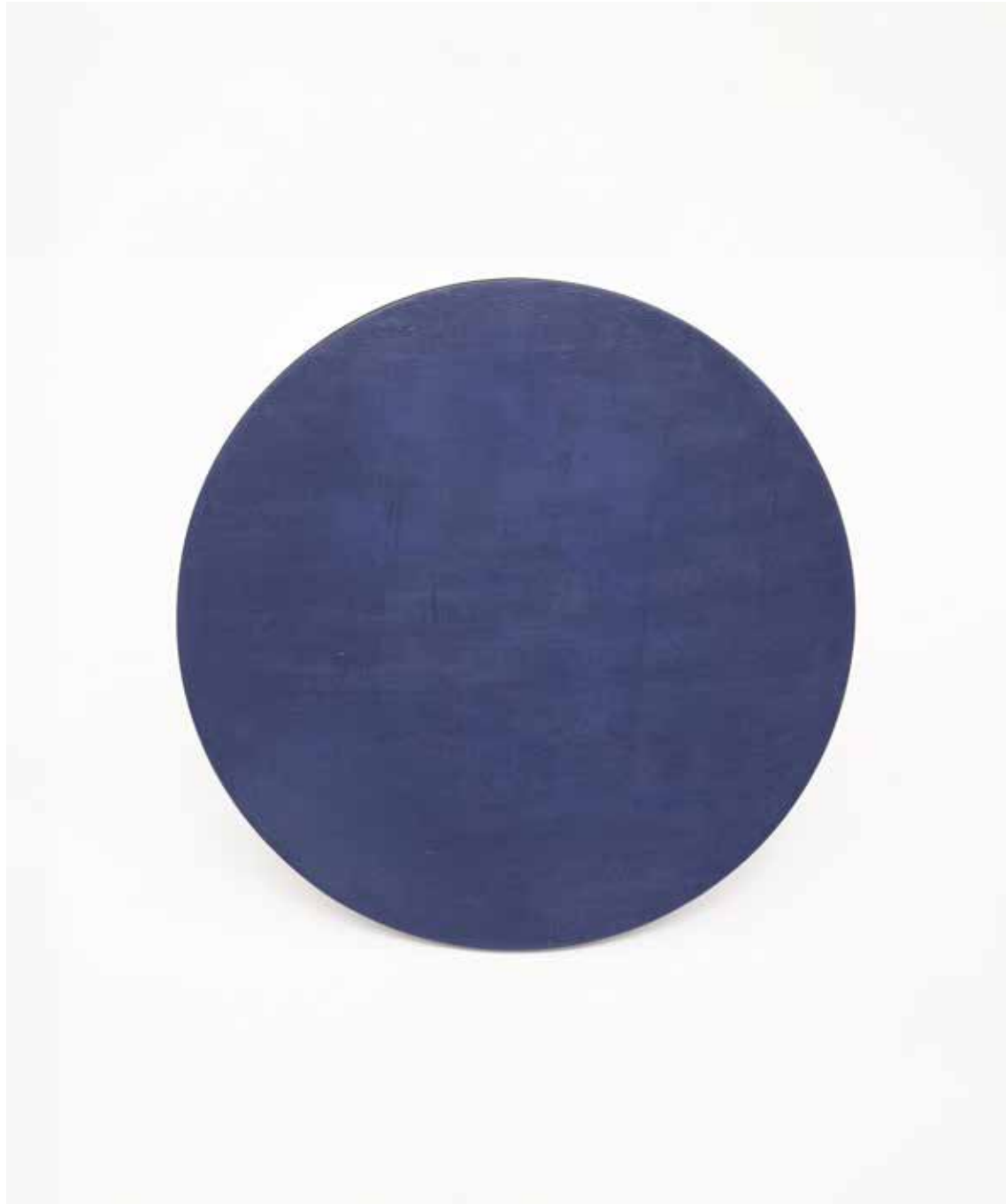
Rolling Blue and Black 2024 Handshaped from solid clear glass, applied with colored Japanese lacquer Ø25,7 x 15 cm Unique piece