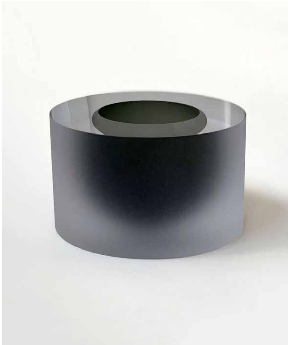
Cylinder with floating bowl. Translucent Black 2019 Mouthblown, handcut and mattbrushed glass Ø20 x 12 cm Unique piece