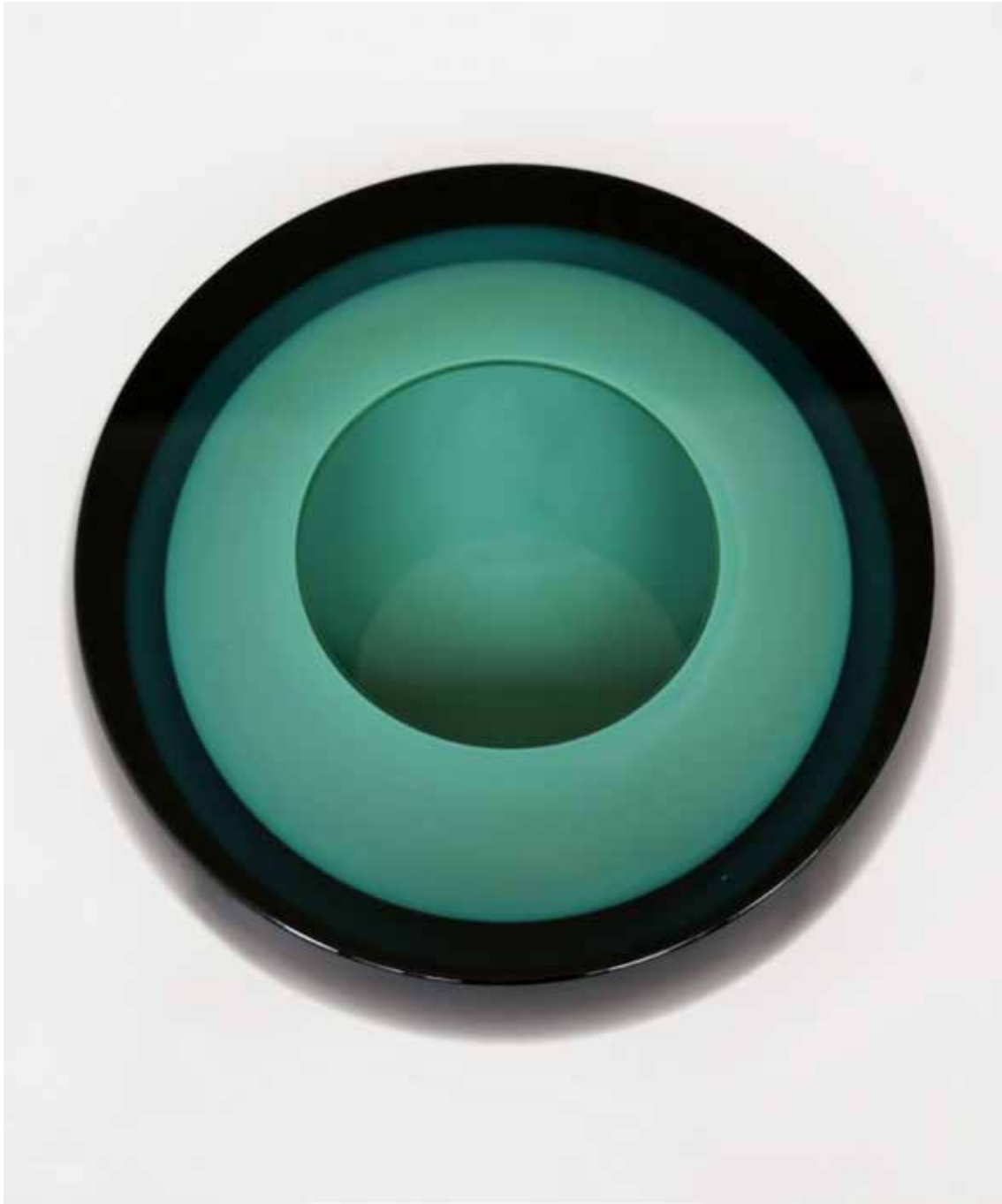
Viridian Midnight 2023 Mouthblown, handcut and polished, layered glass Ø30 x 11,5 cm Unique piece