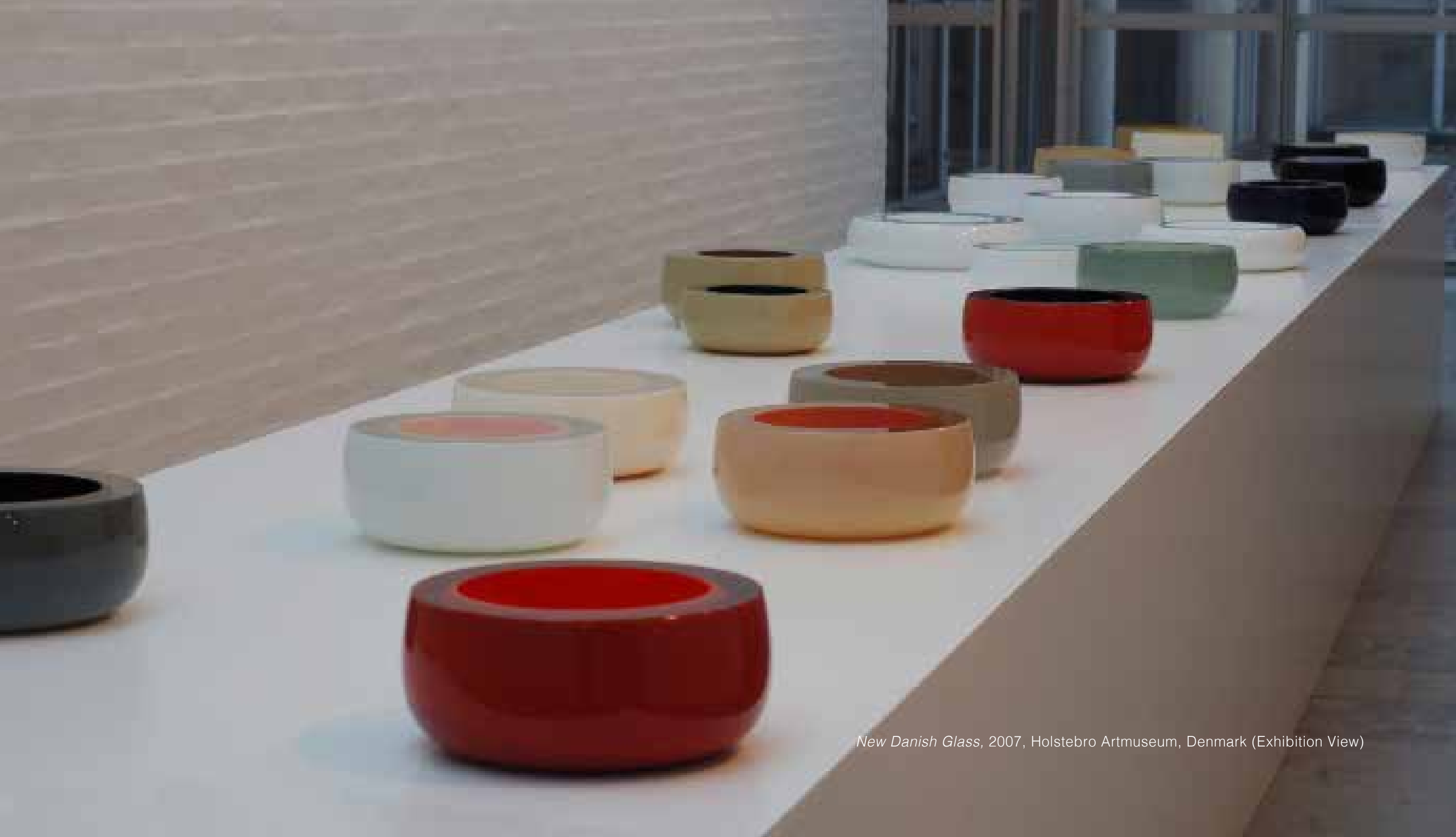
New Danish Glass, 2007, Holstebro Artmuseum, Denmark (Exhibition View)