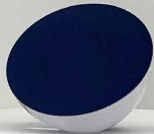
Stereo Exchange, 2021, Copenhagen, Denmark (Exhibition View)