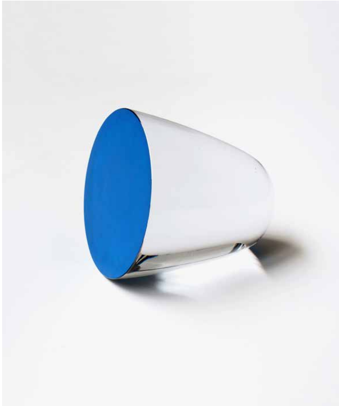
Rotating Cerulean Blue 2023 Handshaped from solid clear glass, applied with colored Japanese lacquer Ø19 x 19 cm Unique piece