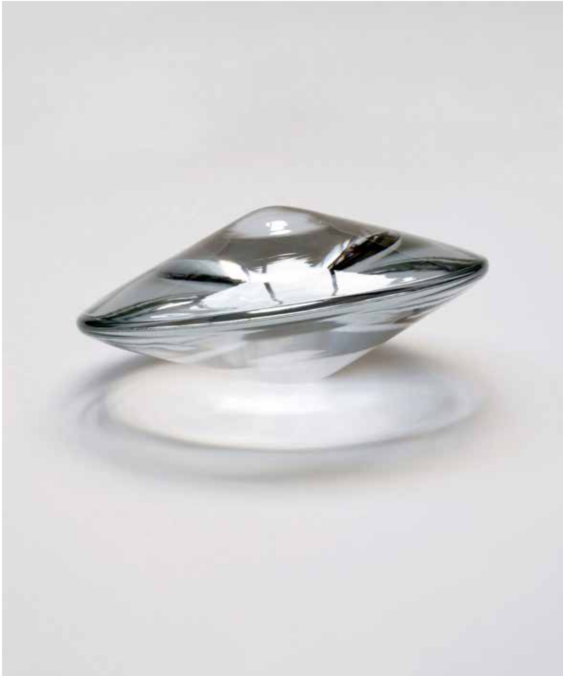
Double Clear Top 2023 Handshaped, handcut and polished clear glass Ø35 x 15 cm Unique piece