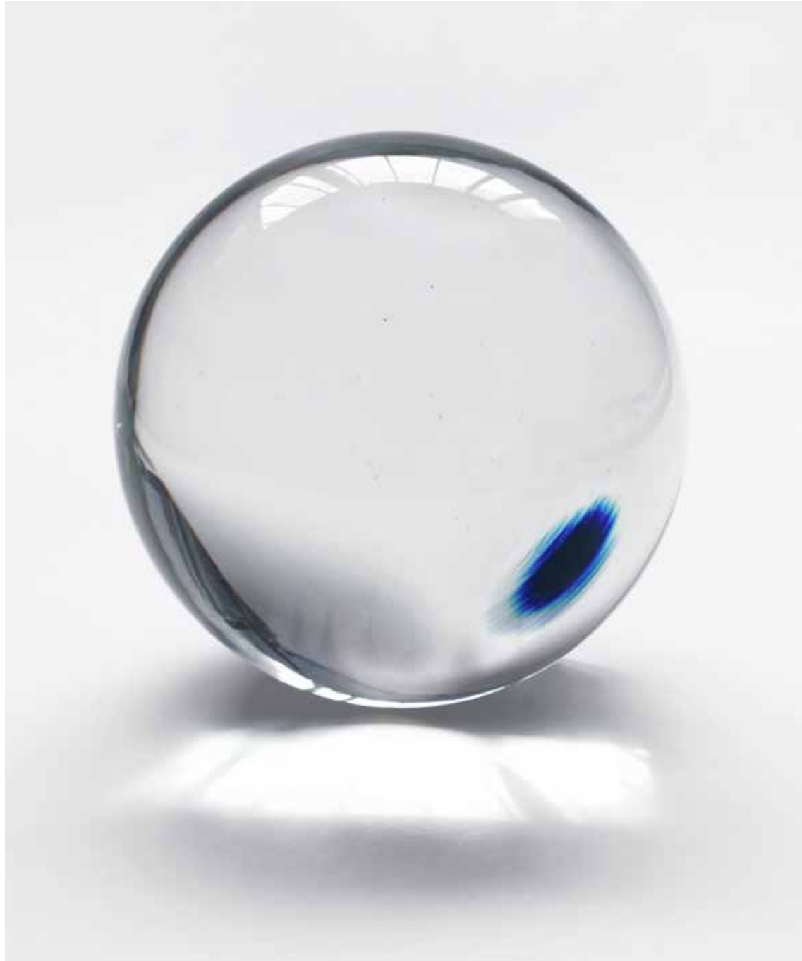
Blue Necked Sphere 2023 Handshaped from solid clear glass, applied with colored Japanese lacquer Ø19 x 19,5 cm Unique piece