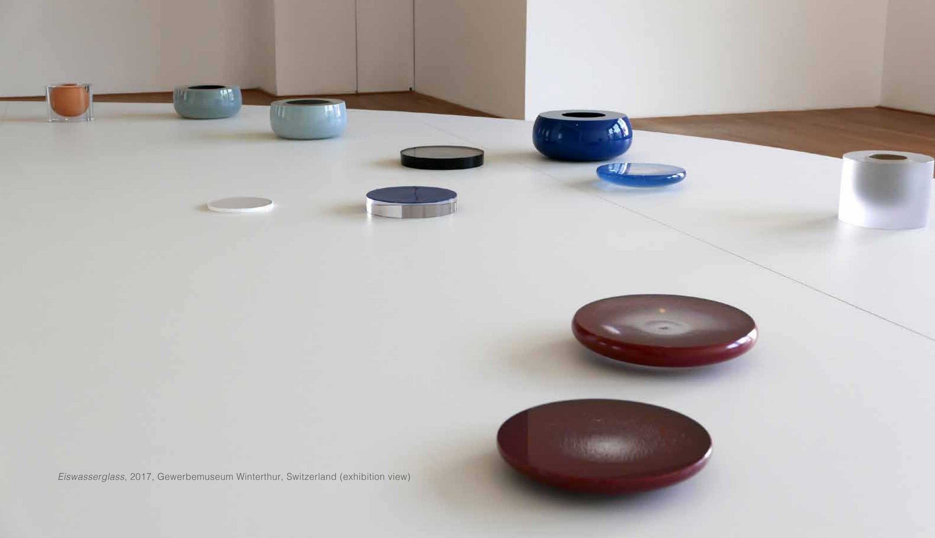
Eiswasserglass , 2017, Gewerbemuseum Winterthur, Switzerland (exhibition view)