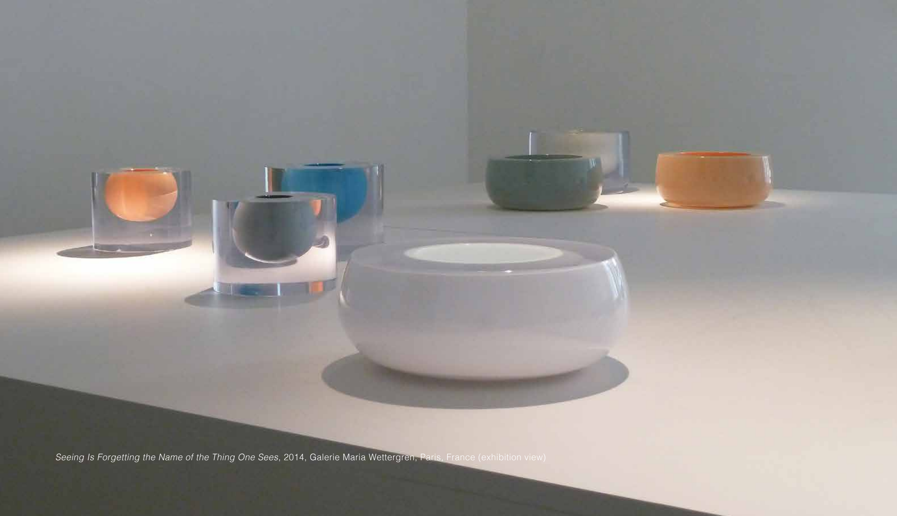
Seeing Is Forgetting the Name of the Thing One Sees , 2014, Galerie Maria Wettergren, Paris, France (exhibition view)