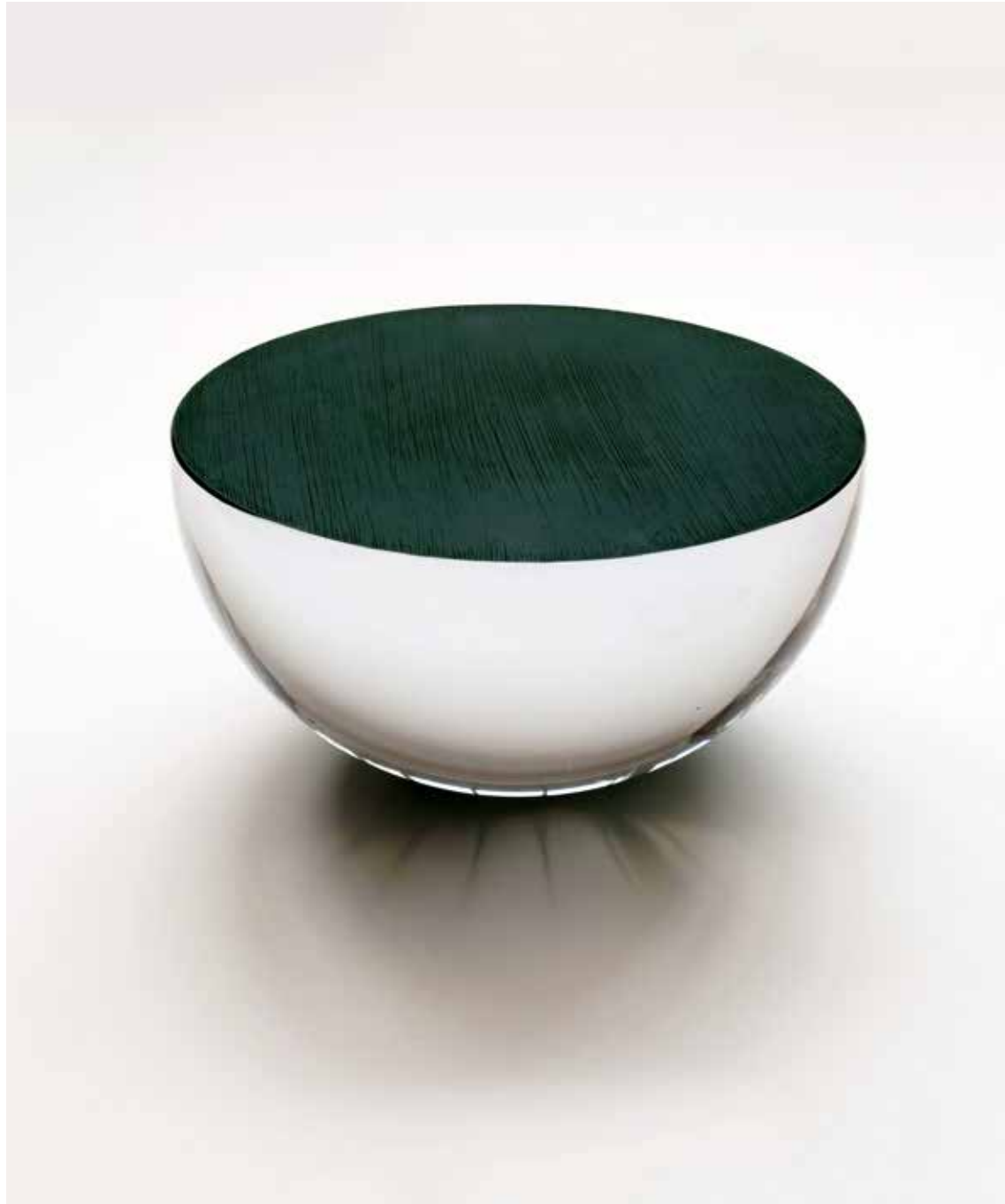
Balancing Midnight Green 2023 Handshaped from solid clear glass, applied with colored Japanese lacquer Ø26,5 x 14,5 cm Unique piece