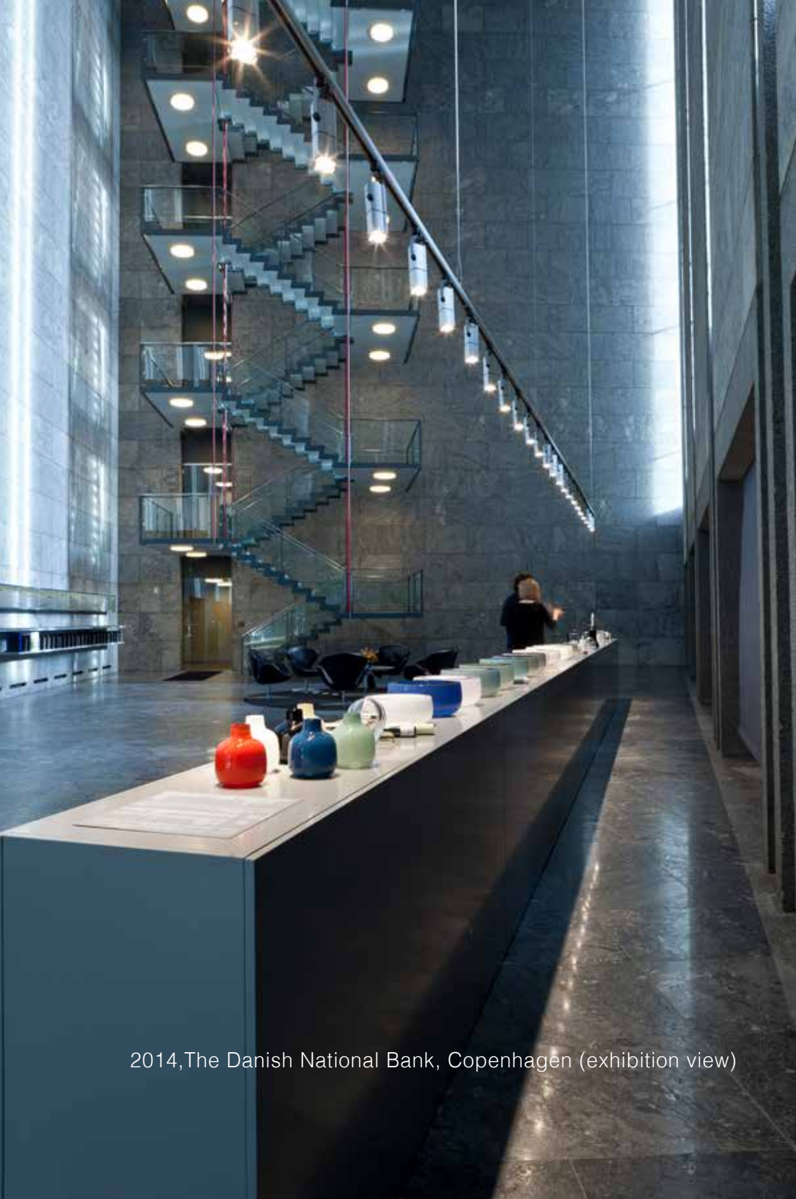
2014, The Danish National Bank, Copenhagen (exhibition view)