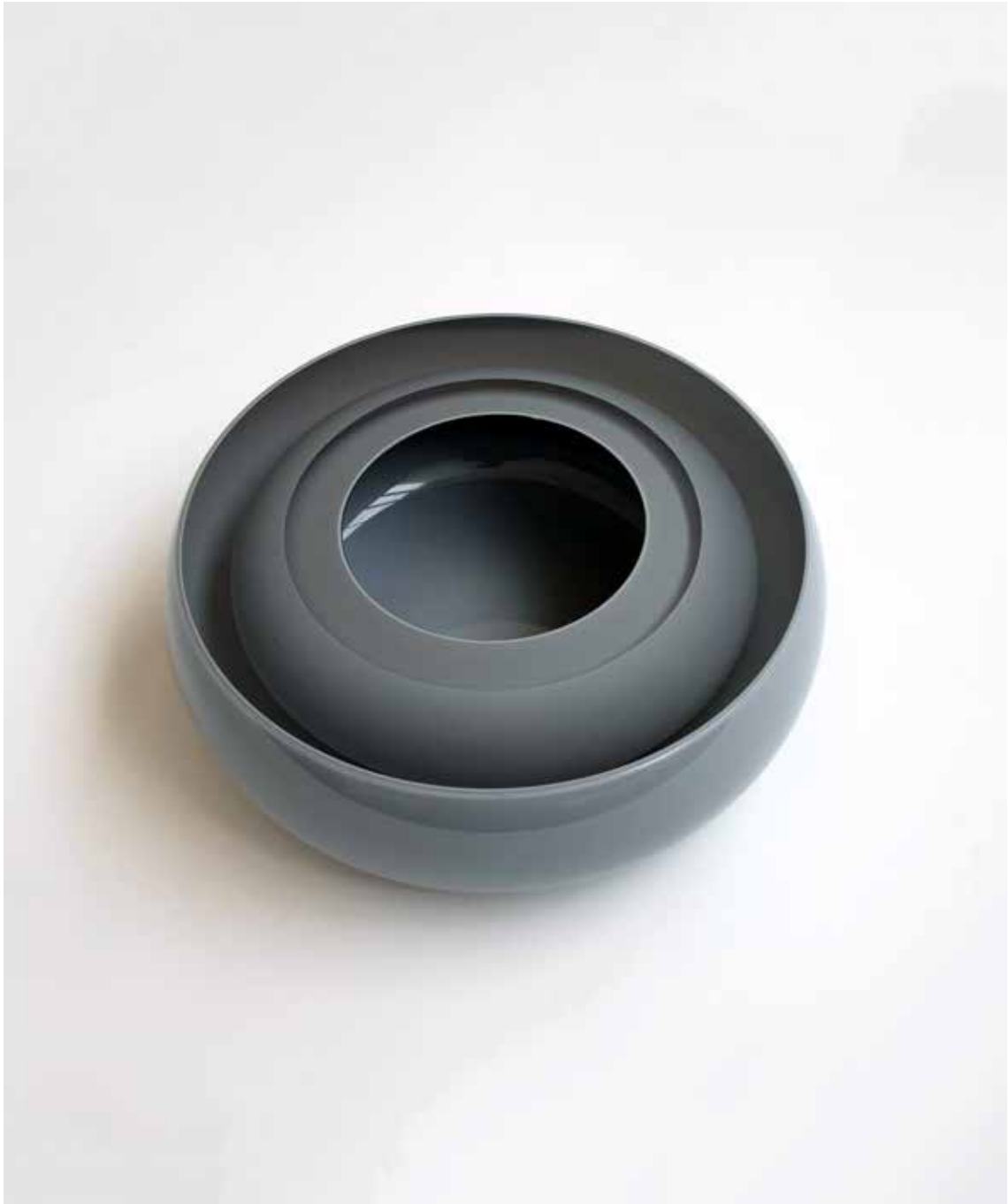
Grey Layers 2023 Mouthblown, handcut and polished, layered glass Ø31 x 10,5 cm Unique piece